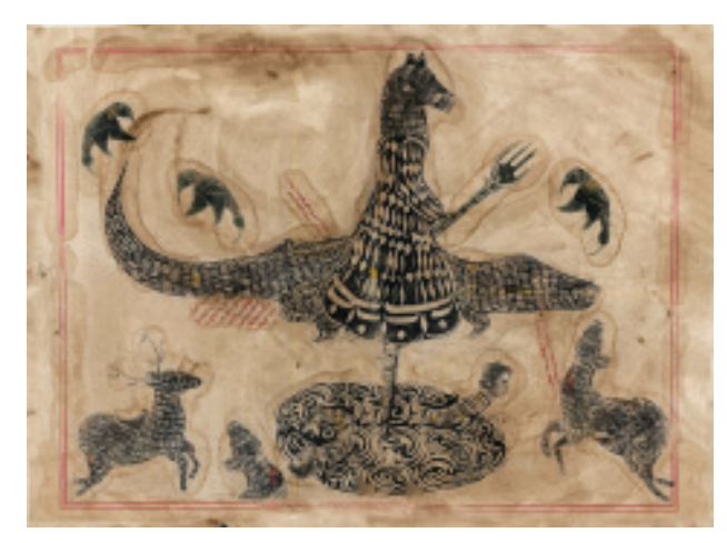
Illusion, 2018, printmaking on handmade paper, 17.50 x 23.50 in