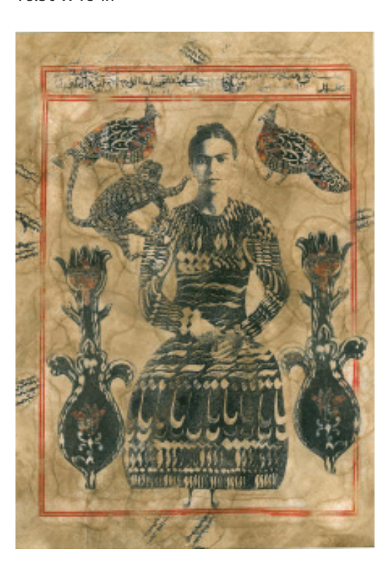
Frida Kahlo 2016 printmaking on handmade paper 20 x 14.50 in