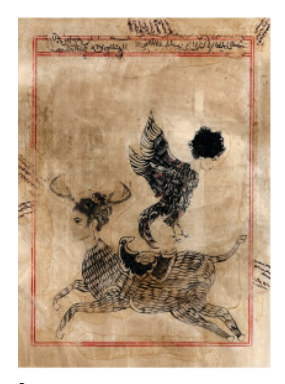
Dream 2018 printmaking on handmade paper 18 x 13.50 in