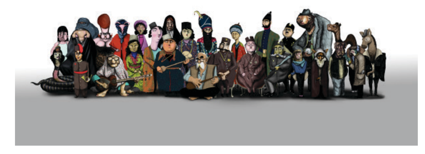
Comrades, 2019, Digital Print on Eco Canvas, 27.50 x 55.50 in