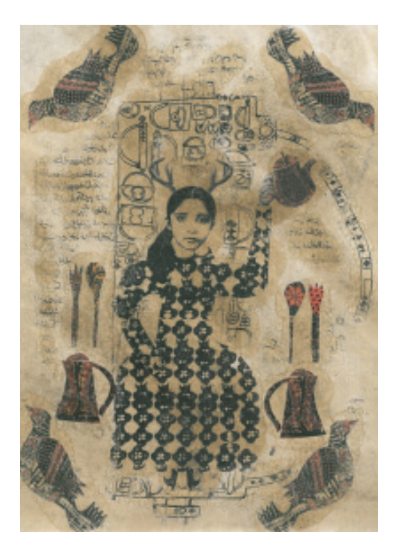
New Year's Dinner 2016 printmaking on handmade paper 23.50 x 19.50 in