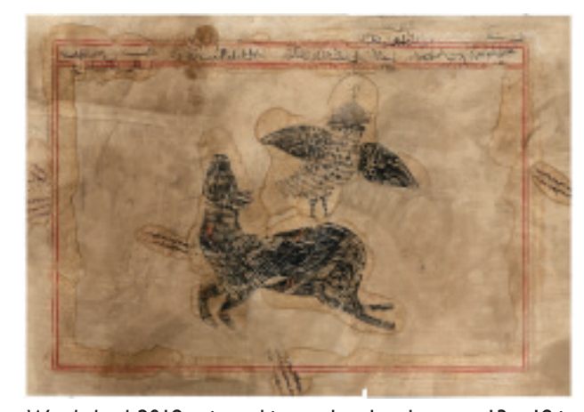
Wonderland, 2018, printmaking on handmade paper, 13 \times 19 in

Barrangi regularly exhibits in the UK and internationally, and his work has been featured in multiple publications, festivals, and prizes. These include Muestra del IV Premi International, Tragaluz; Pressing Matters; Shape Open 2018: Collective Influence; Illustrate 2018, Portugal; Art TSUM, Kiev; Ratata Festival, Macerata; The 6th International Tokyo Mini-Print Triennial; Bologna Illustrators Exhibition 2018; Story Museum, Oxford; and Hafez Gallery in Saudi Arabia 2019. As of June 2019, two of Barrangi's works have been acquired by the British Museum for their permanent collection.