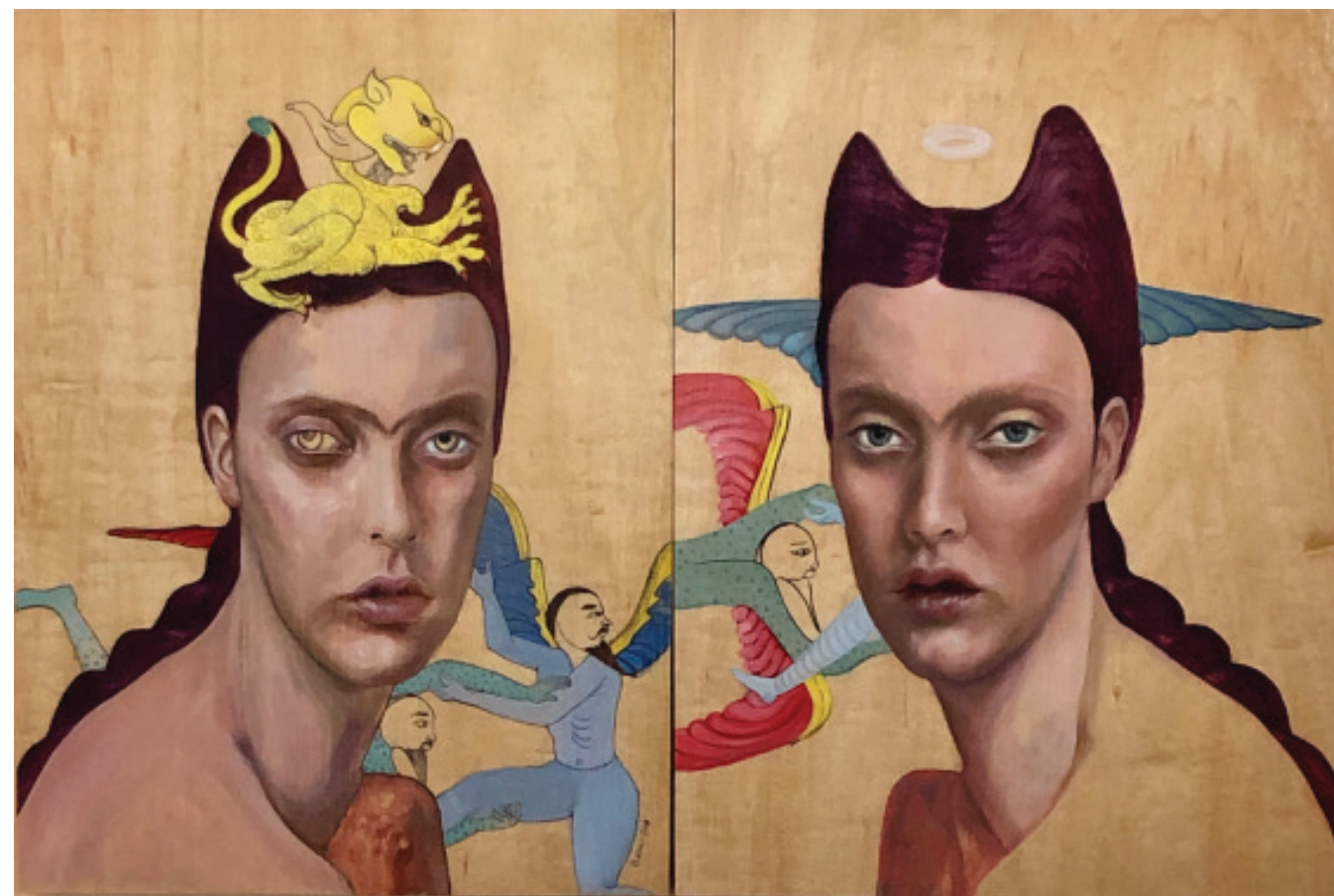
Untitled- Crown Series, 2019, Oil and Pen on wood panel, 16 x 24 in