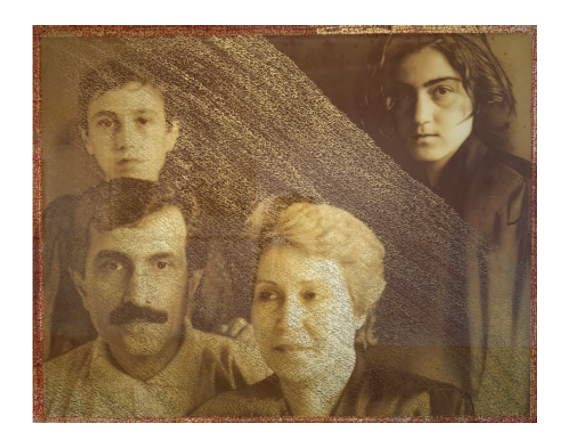
Untitled 2011 digital inkjet print with handwritten calligraphy 31 x 39.5 in

Hadi creates in layers, he is always experimenting with the developing process of each photograph. Using a myriad of antique cameras, Hadi's work begins with an analog portrait of his subjects, followed by the manipulation of those images. Hadi carefully pulls each photograph apart in their base negative form, and applies emulsion in a painterly fashion to create spontaneous and dynamic effects to the ink of the photograph. Through this layering of positives and negatives, text and imagery, Hadi creates imagery that is unique and soulful, and as modern as it is vintage.