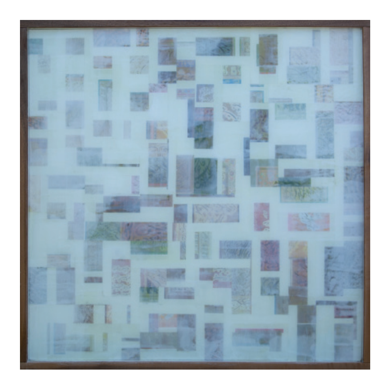
Subsistence 7 2019 Paper, Paraffin Wax, and Epoxy Resin on Wood Panel 36 x 36 in

unrecognizable. Through that process, she has shown how memory fails to preserve the details of the past, yet maintains a totality of feelings and emotions that have been embedded into ones being. To create the Subsistence series, Shadi takes a similar approach, this time going through books of Persian art and calligraphy (which represent a part of her cultural heritage) cutting the pages into small fragments and pasting them in a new