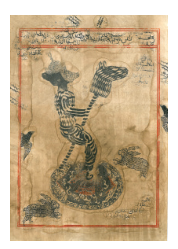
Playful 2016 printmaking on handmade paper 18.50 x 13 in