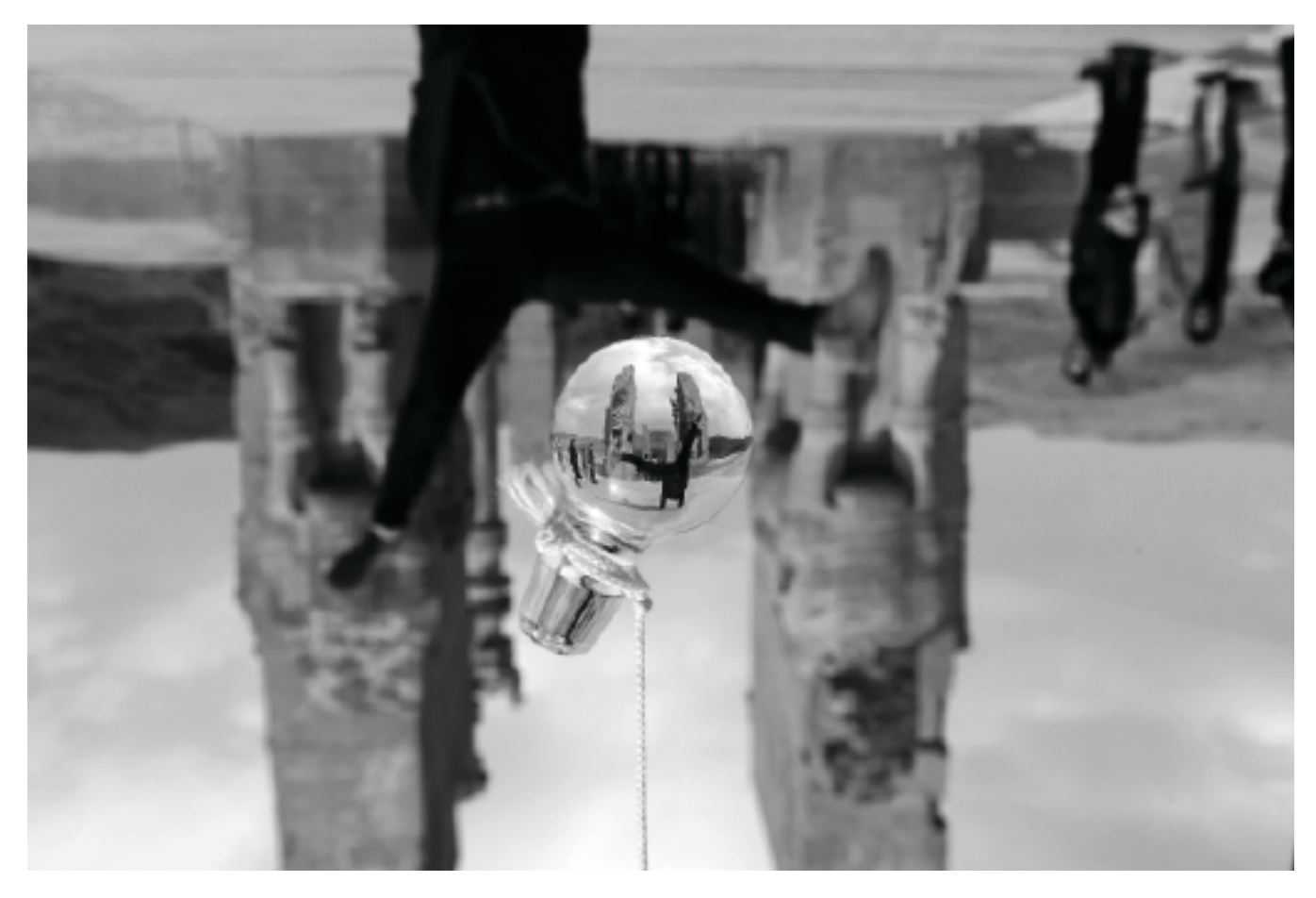
Persepolis - The Stopper Series (2/5), 2017, Digital photography/Gelatin silver print, 30 x 45 in

Dariush Nehdaran's photography captures intimate moments suspended in time. He aims to turn spectators into participants, drawing them into contemporary Persian culture. His photographs and video works are available both in public and private collections worldwide including the Armando Reverón Contemporary Art Museum in Caracas-Venezuela 2018, the Los Angeles County Museum of Art (LAC-MA) in the US 2016, and the Salsali Private Museum in Dubai-UAE 2012. (San Francisco)