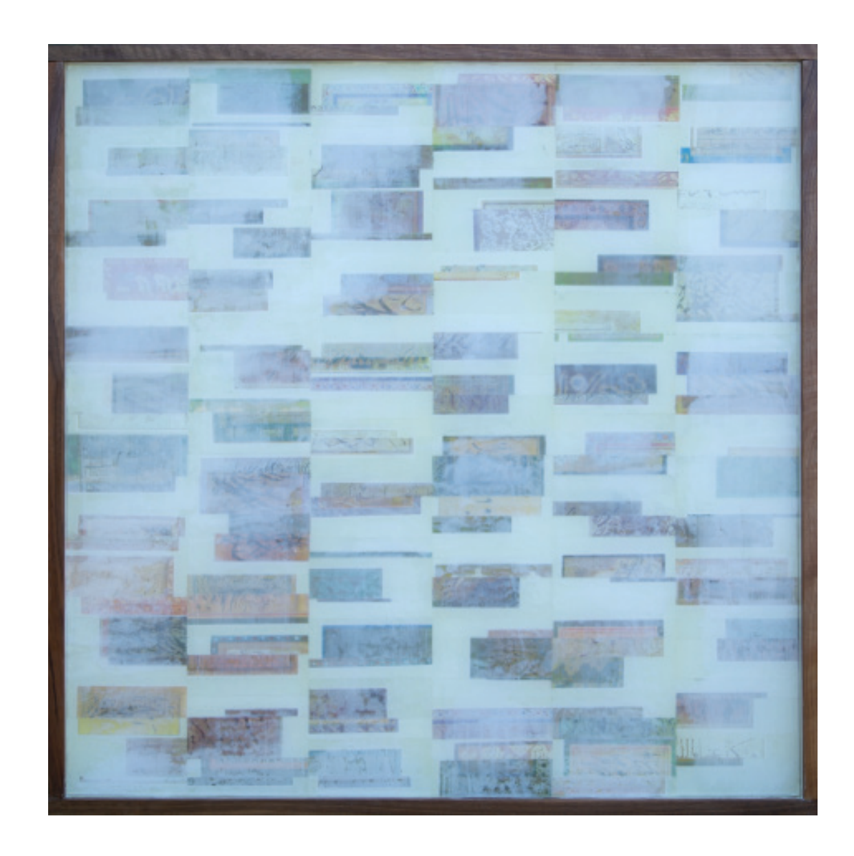
Subsistence 6 2019 Paper, Paraffin Wax, and Epoxy Resin on Wood Panel 36 x 36 in