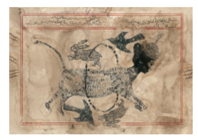
Untitled, 2018, printmaking on handmade paper, 12 x 16.50 in