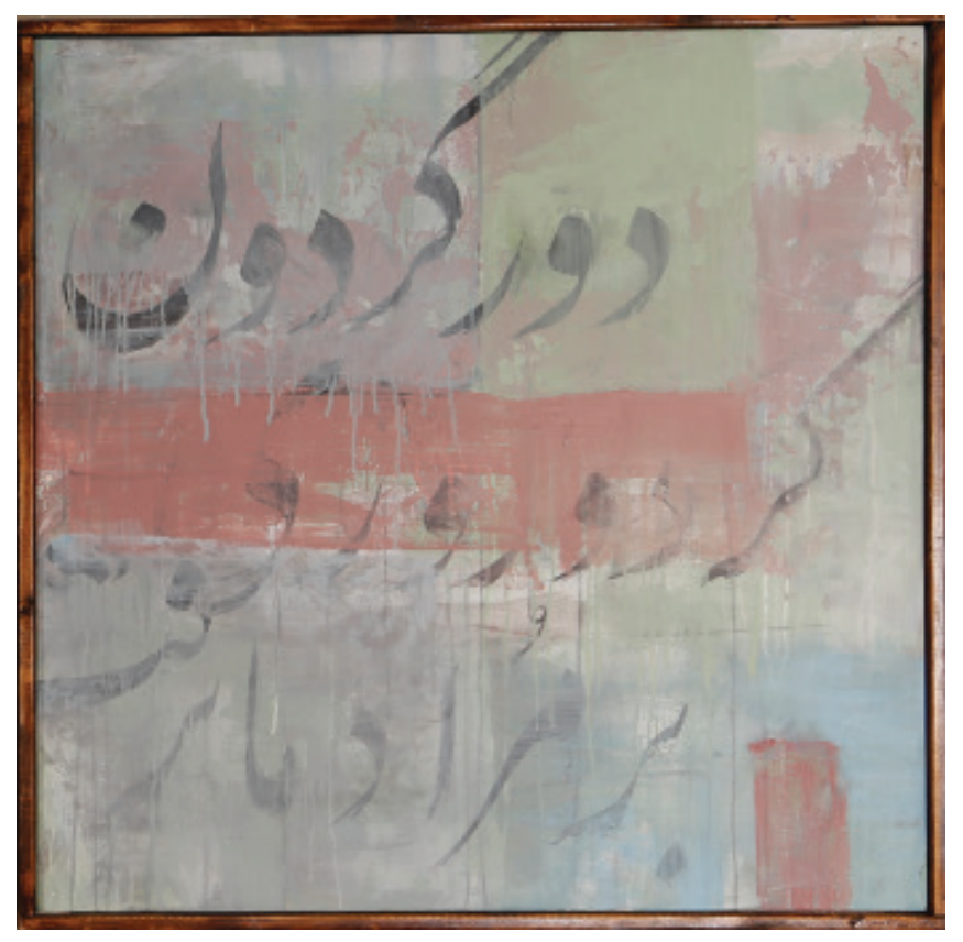
Gham Makhor Triptych 2019 Acrylic on wood panel 36 x 108 in