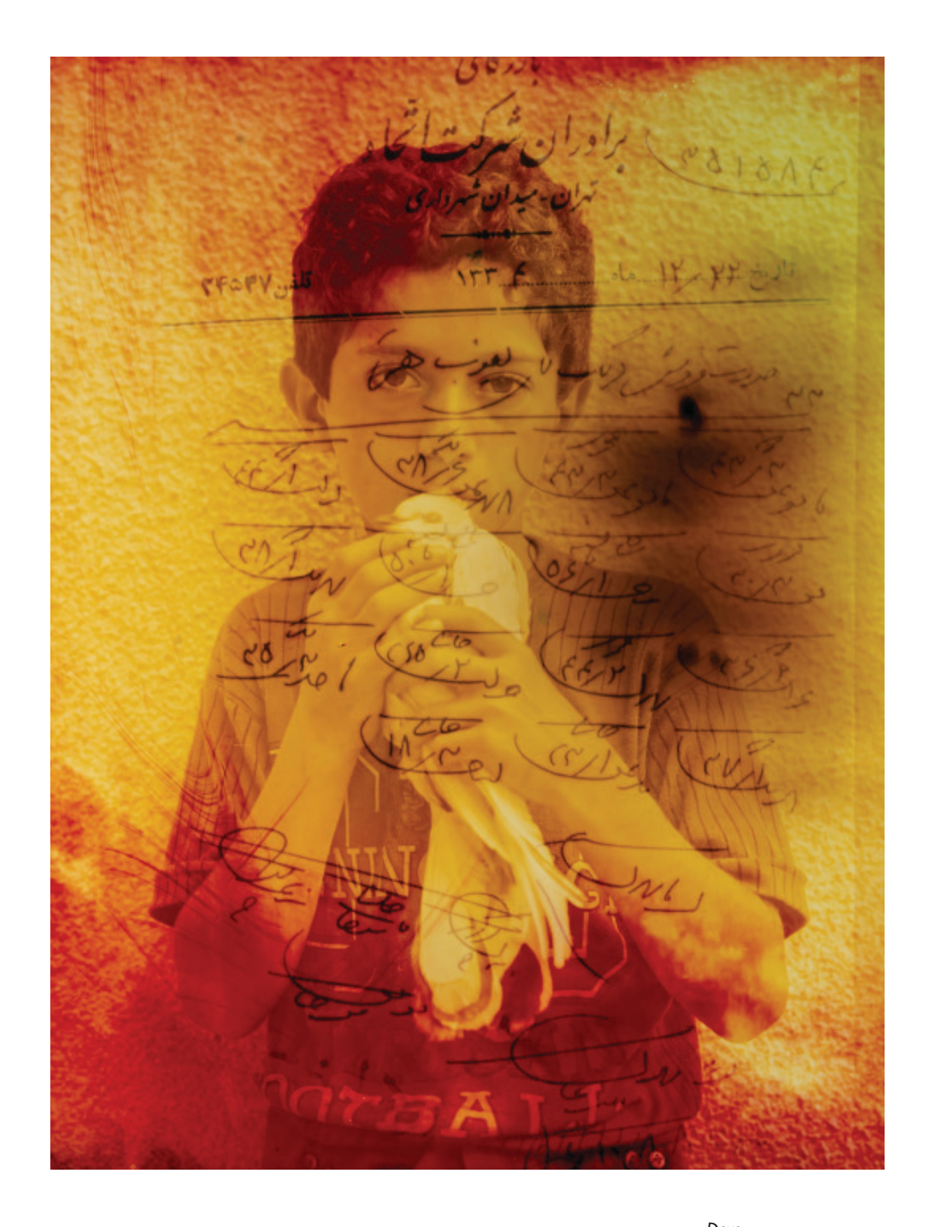
Dove 2004 Layered Analog C-Print 40 x 30 in