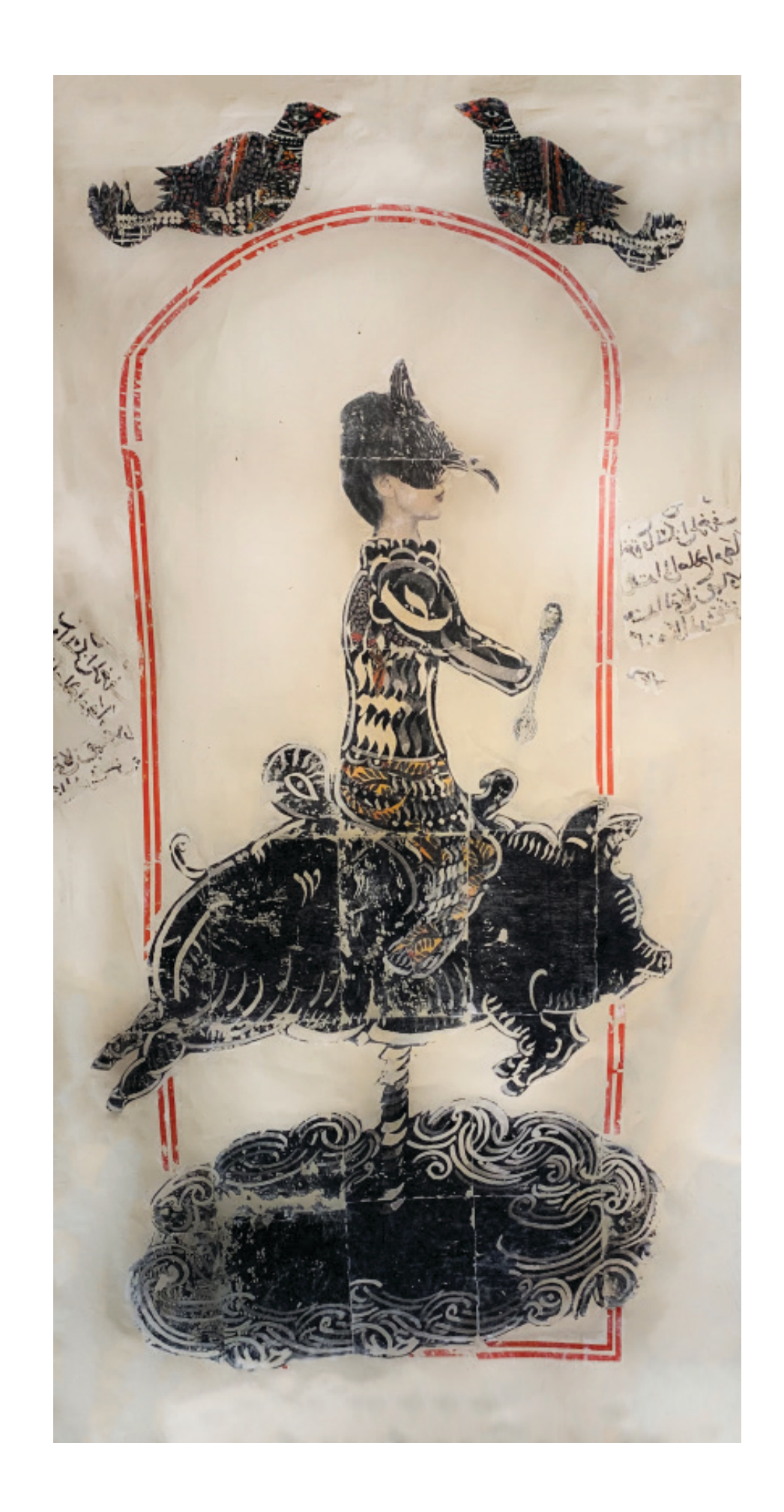
Mary Grant 2019 Printmaking 122 x 63 in $15,000