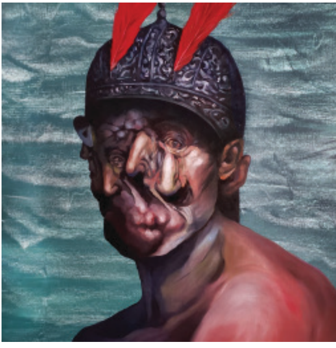
Memories Transfigured IV 2019 Oil on canvas 44 x 44 in