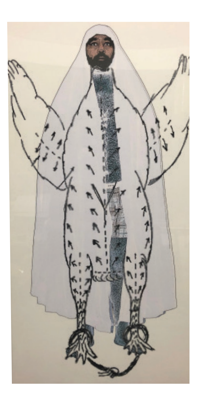
Chicken Ali Khan 2019 Pigment Digital Print 48 x 25 in

Dadgar, in this series of work considers the aesthetics of the printed page; texts, charts, columns and grids—the structure that make newspapers, photographs, dictionaries and maps comprehensible. Intervening within these displays and arrangements of information, Dadgar focuses on the surface-ness of the page, editing as pulls the page apart, creating new texts as it resurfaces the walls. If print culture represents the accumulated knowledge of a civilized society, its alteration conjures new meaning, linking literacy and illiteracy, knowledge and ignorance, artistic freedom and censorship.