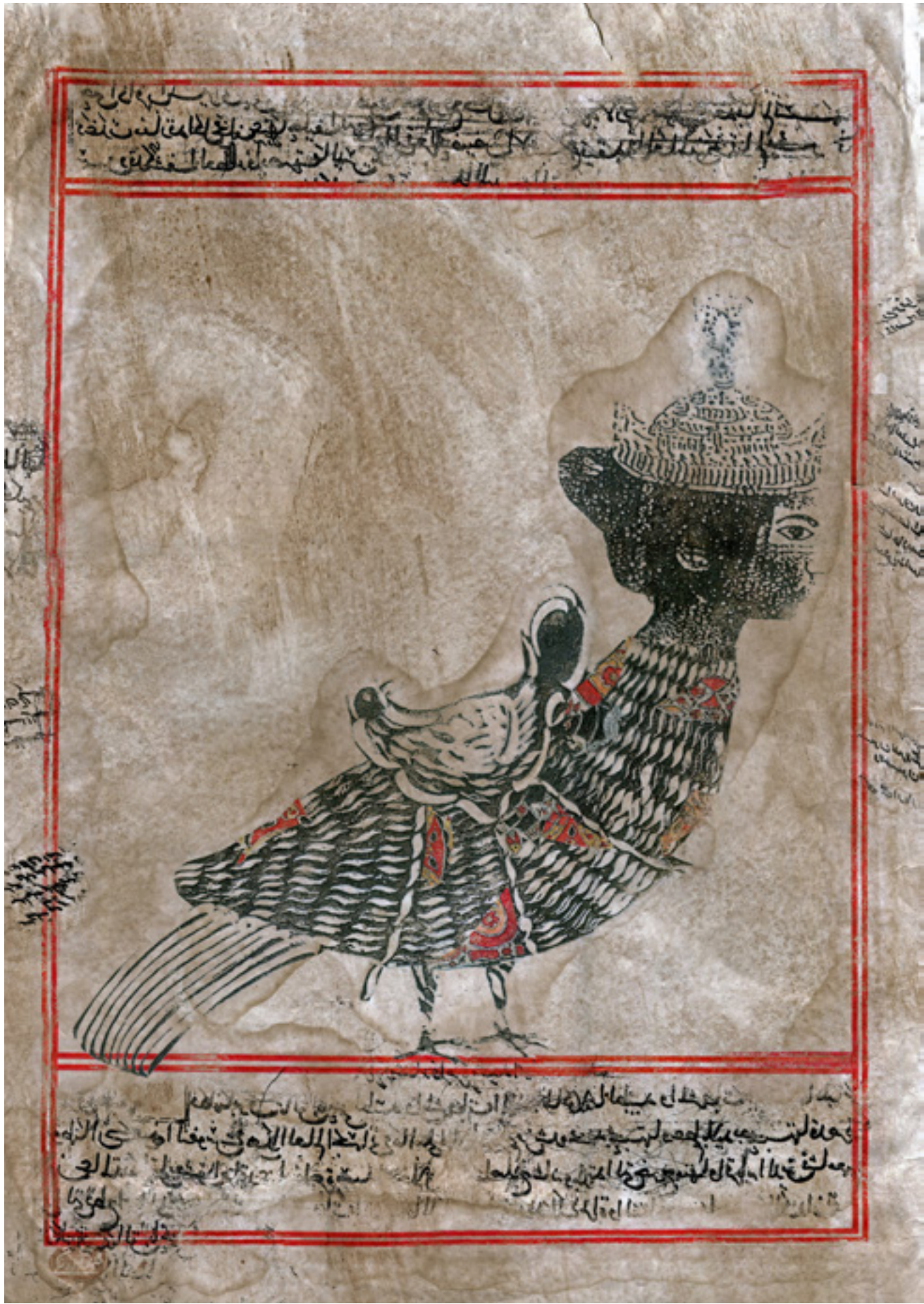
Saddle Up, 2020 printmaking on handmade paper 18 x 12.50 in