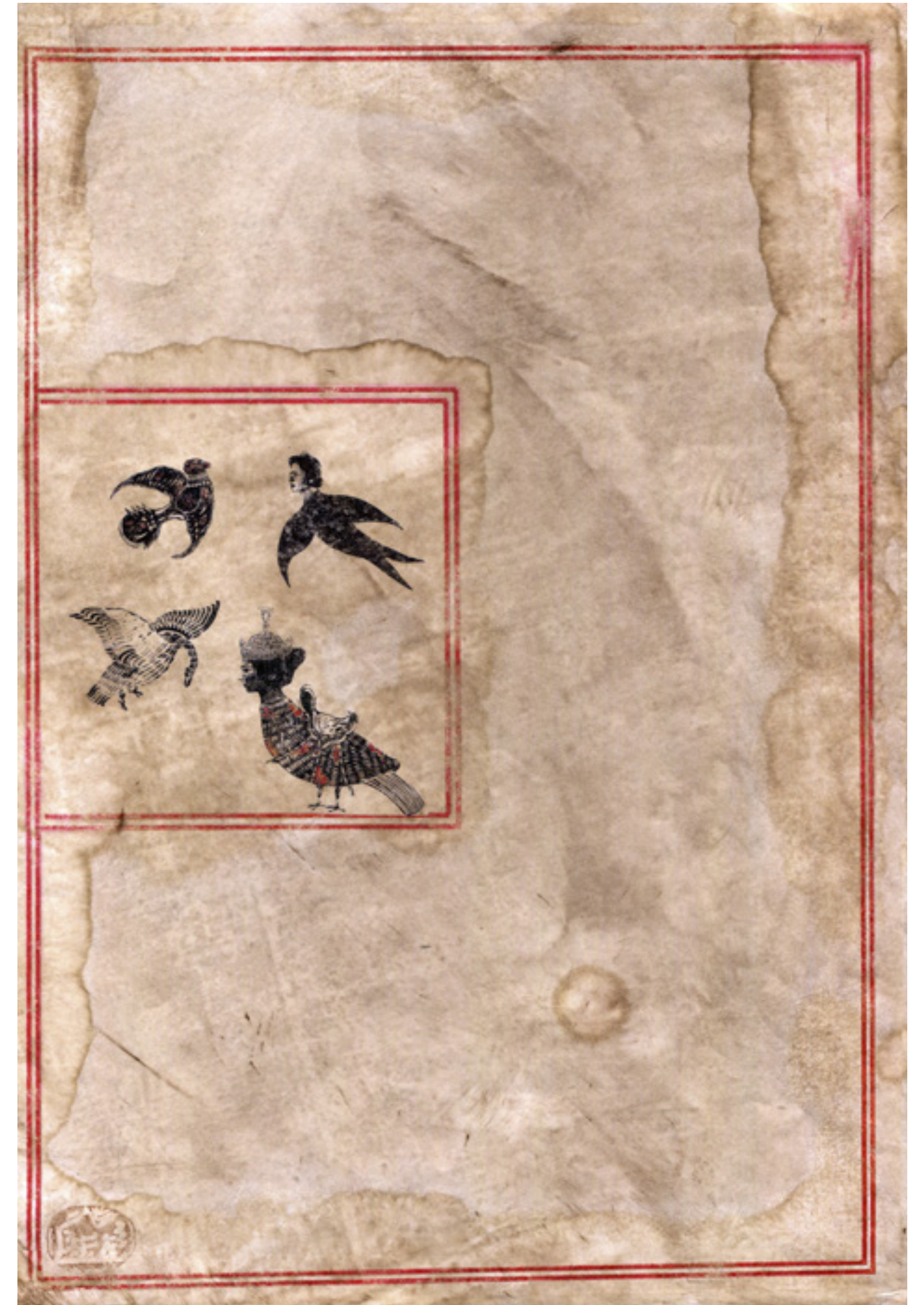
Flight , 2020 printmaking on handmade paper 12.50 x 8.50 in