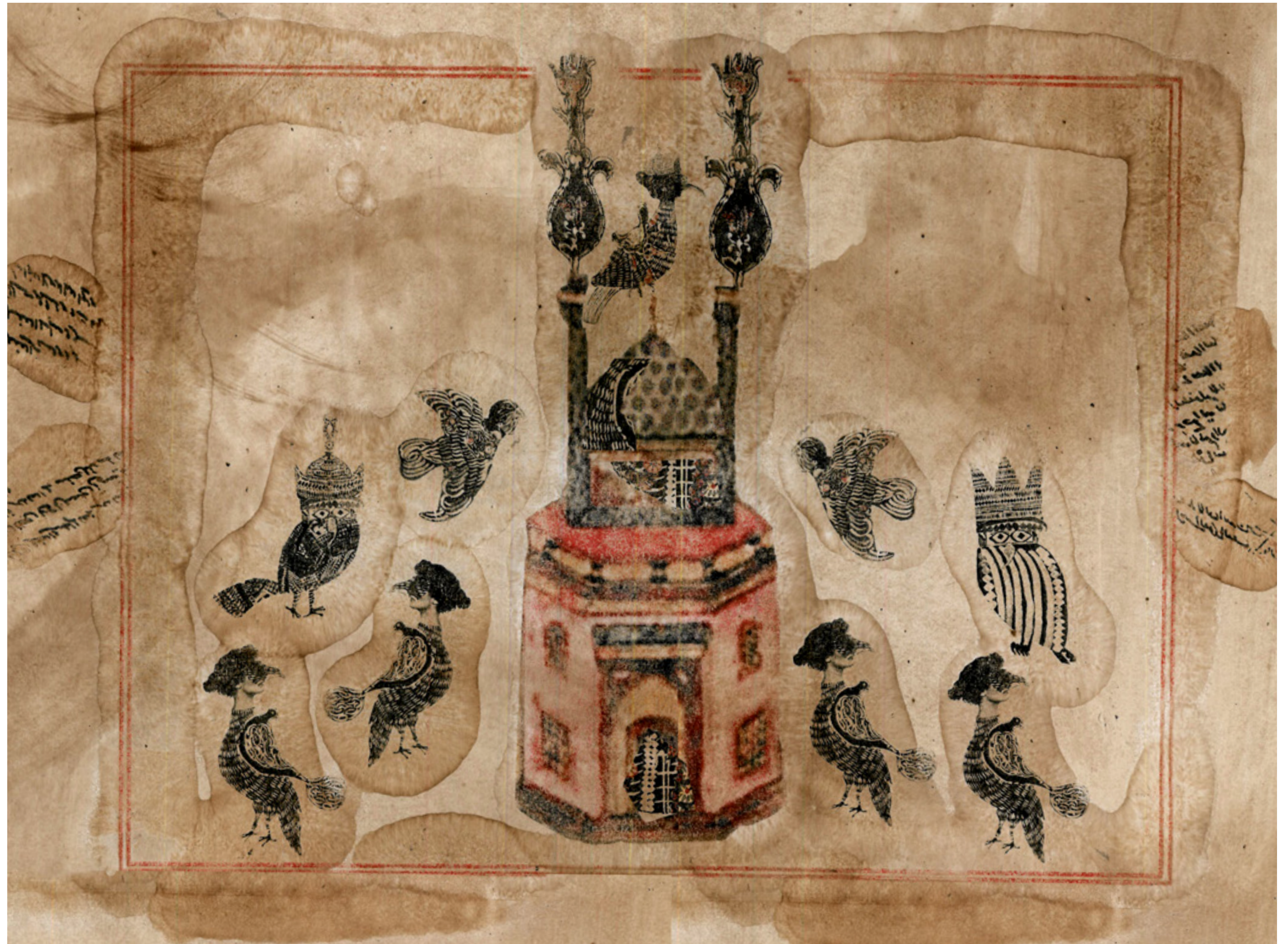
Simorgh's Abode, 2020 printmaking on handmade paper 13 x 18 in