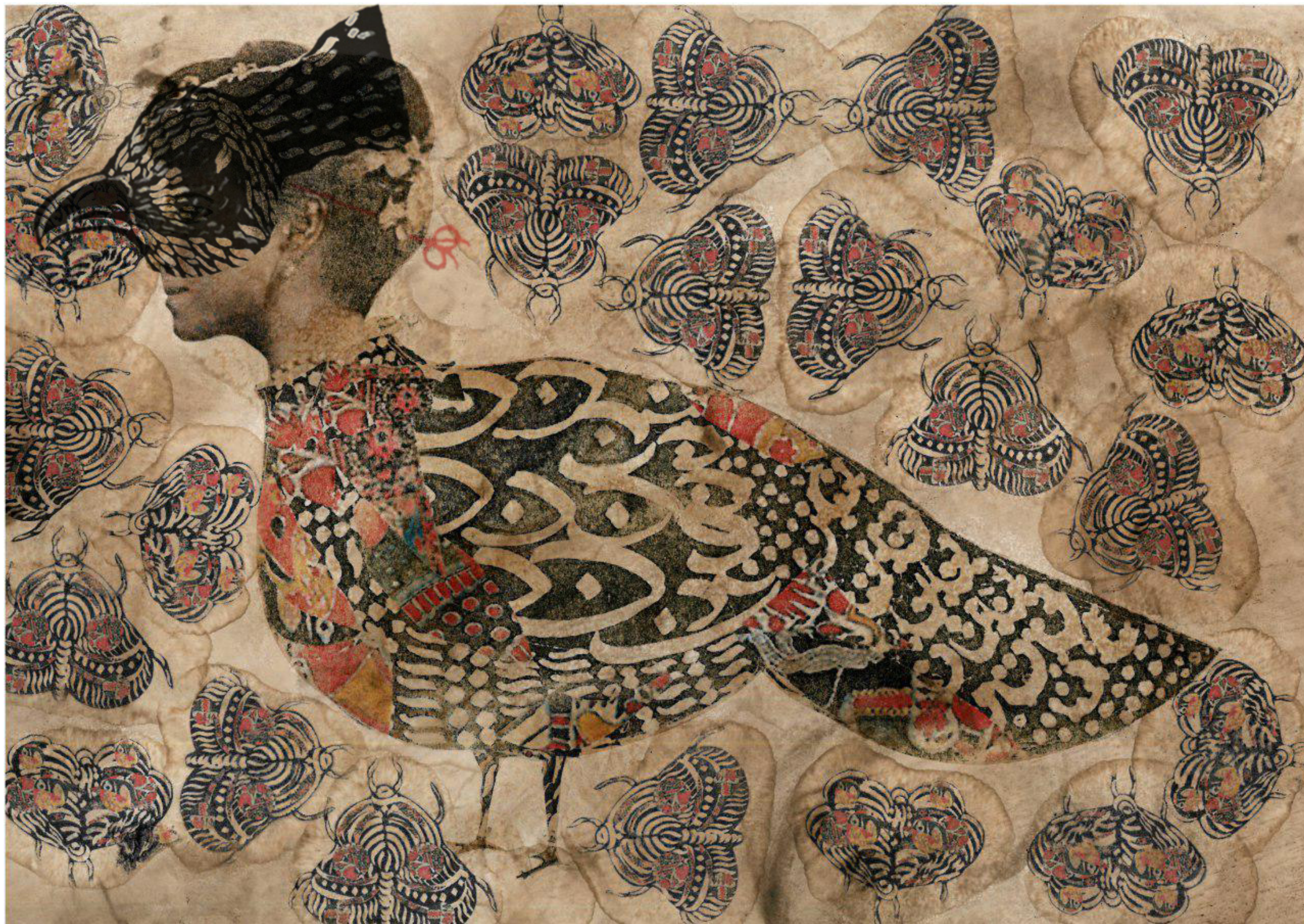
Masked Peacock , 2020 printmaking on handmade paper 11.75 x 16.75 in