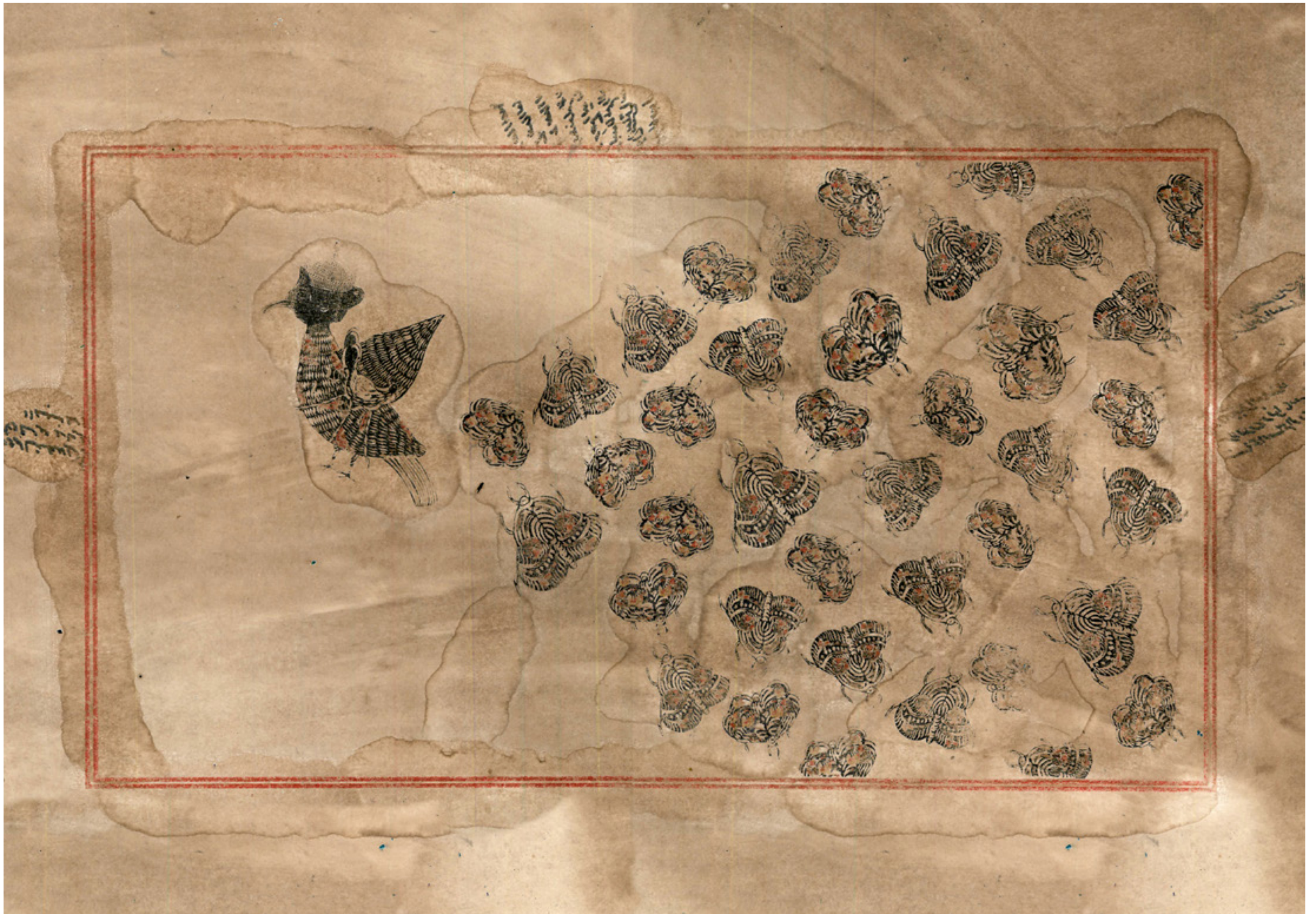
Follow Me , 2020 printmaking on handmade paper 14.50 x 20 in