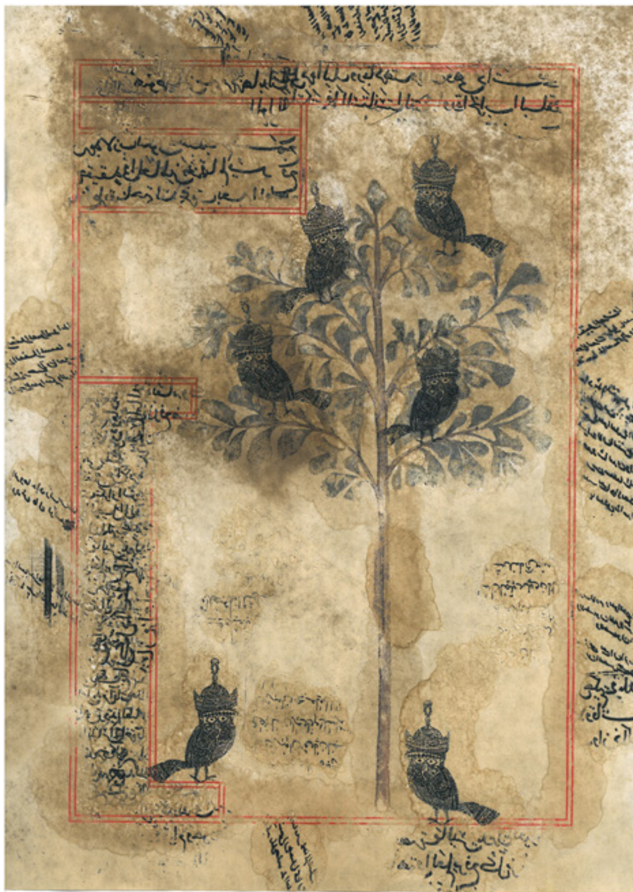
Garden of Eden, 2016, printmaking on handmade paper, 16 x 12 in, $3,200