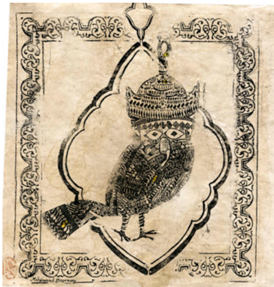
Untitled no. 13, 2020, printmaking on handmade paper, 10 x 10 in, $1,200