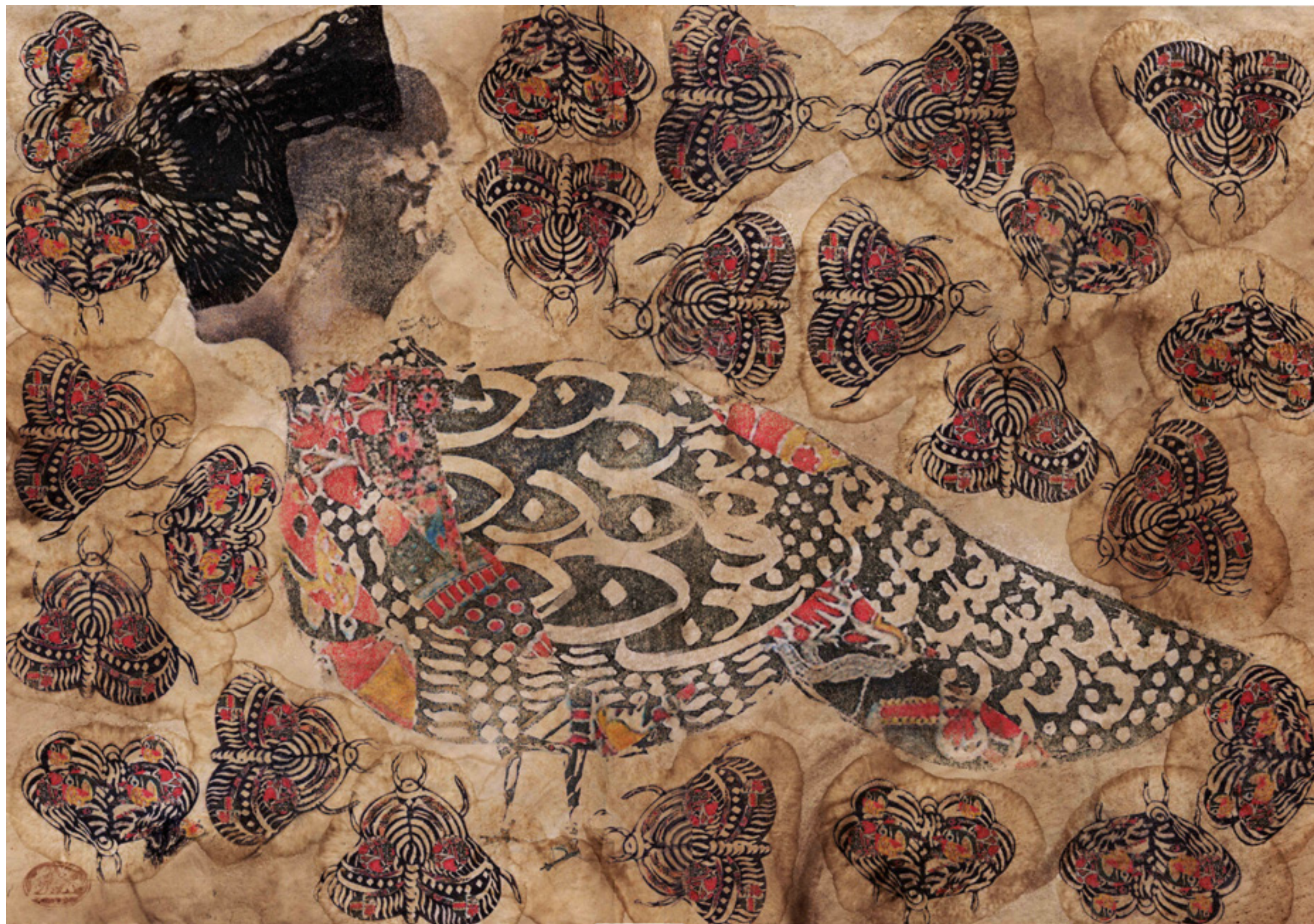
Masked Peacock , 2020, printmaking on handmade paper, 11.75 x 16.75 in, $4,000