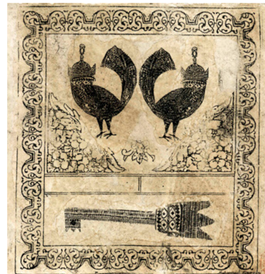
Untitled no. 14, 2020, printmaking on handmade paper, 10 x 10 in, $1,200