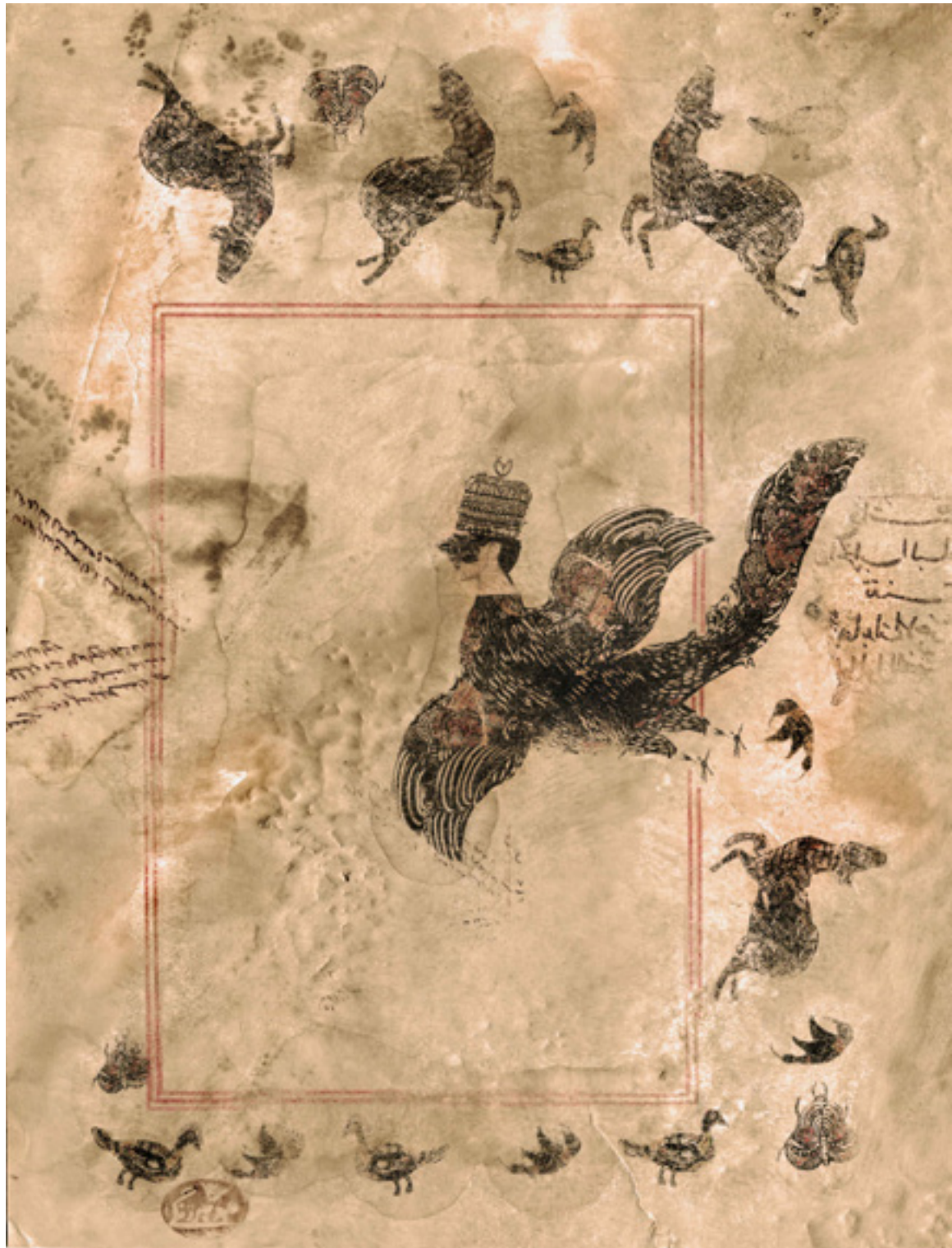
Conference, 2020, printmaking on handmade paper, 12 x 9.25 in, $2,600