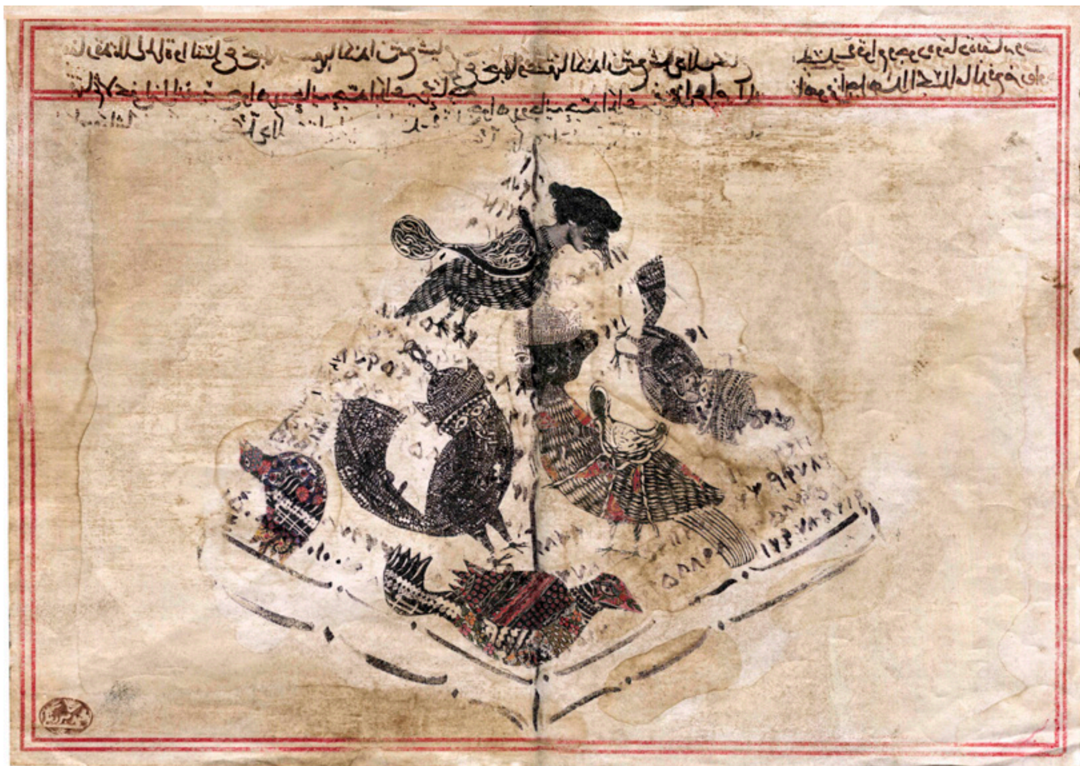
Untitled no. 38, 2020, printmaking on handmade paper, 11.5 x 16.5 in, $2,900