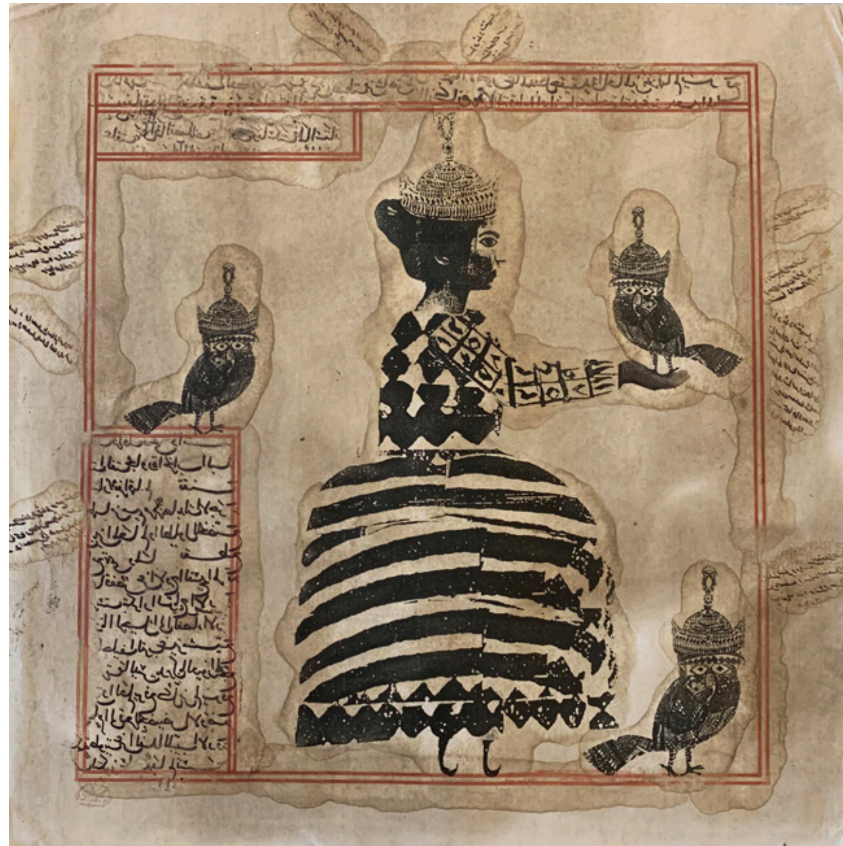
Untitled no. 60, 2020, printmaking on handmade paper, 19.5 x 19.5, $4,000