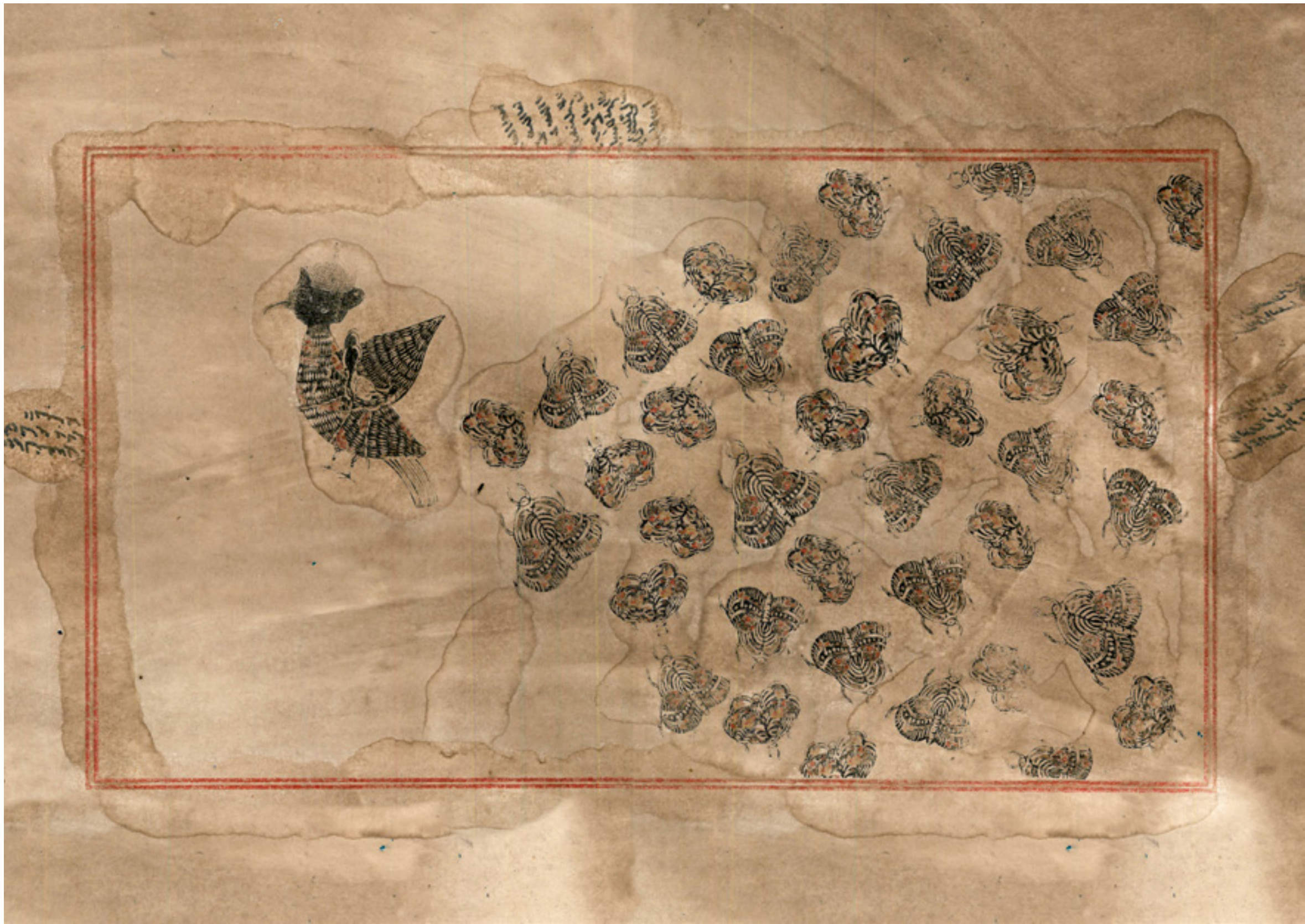
The Call , 2020, printmaking on handmade paper, 15 x 20 in, $3,600