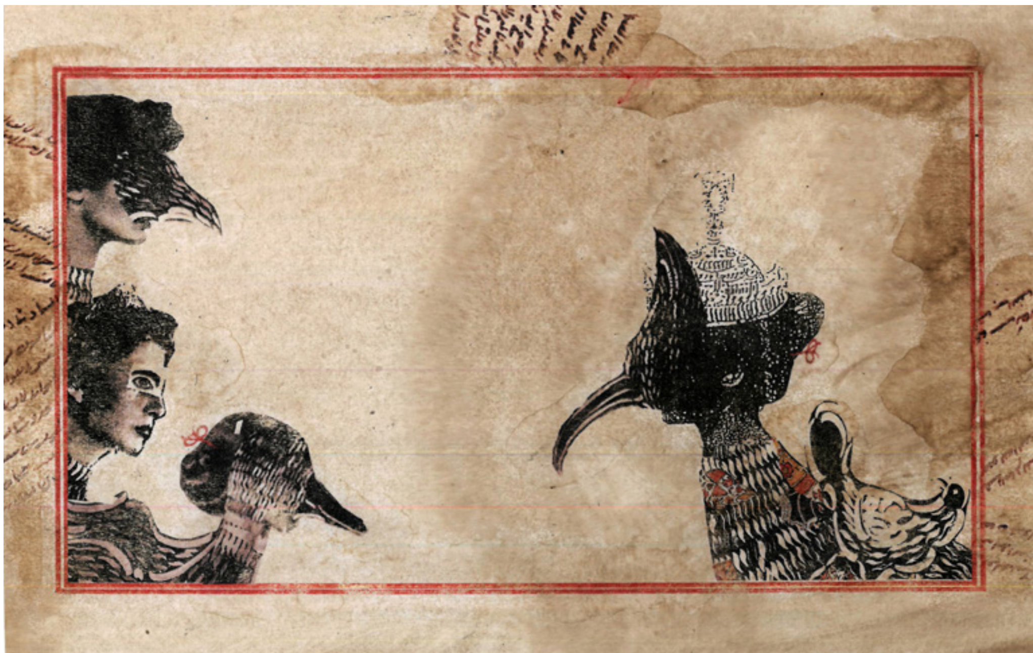
Untitled no. 53, 2020, printmaking on handmade paper, 9.5 x 12 in, $2,600