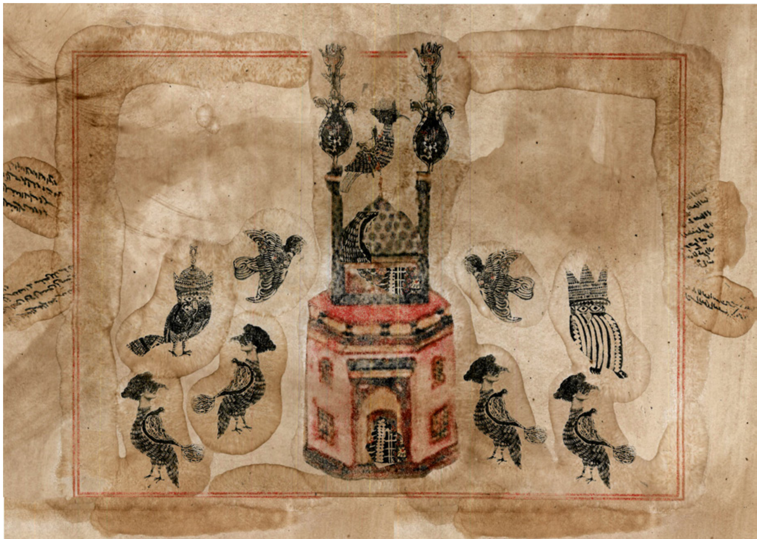
Simorgh's Abode, 2020, printmaking on handmade paper, 13 x 18 in, $3,800