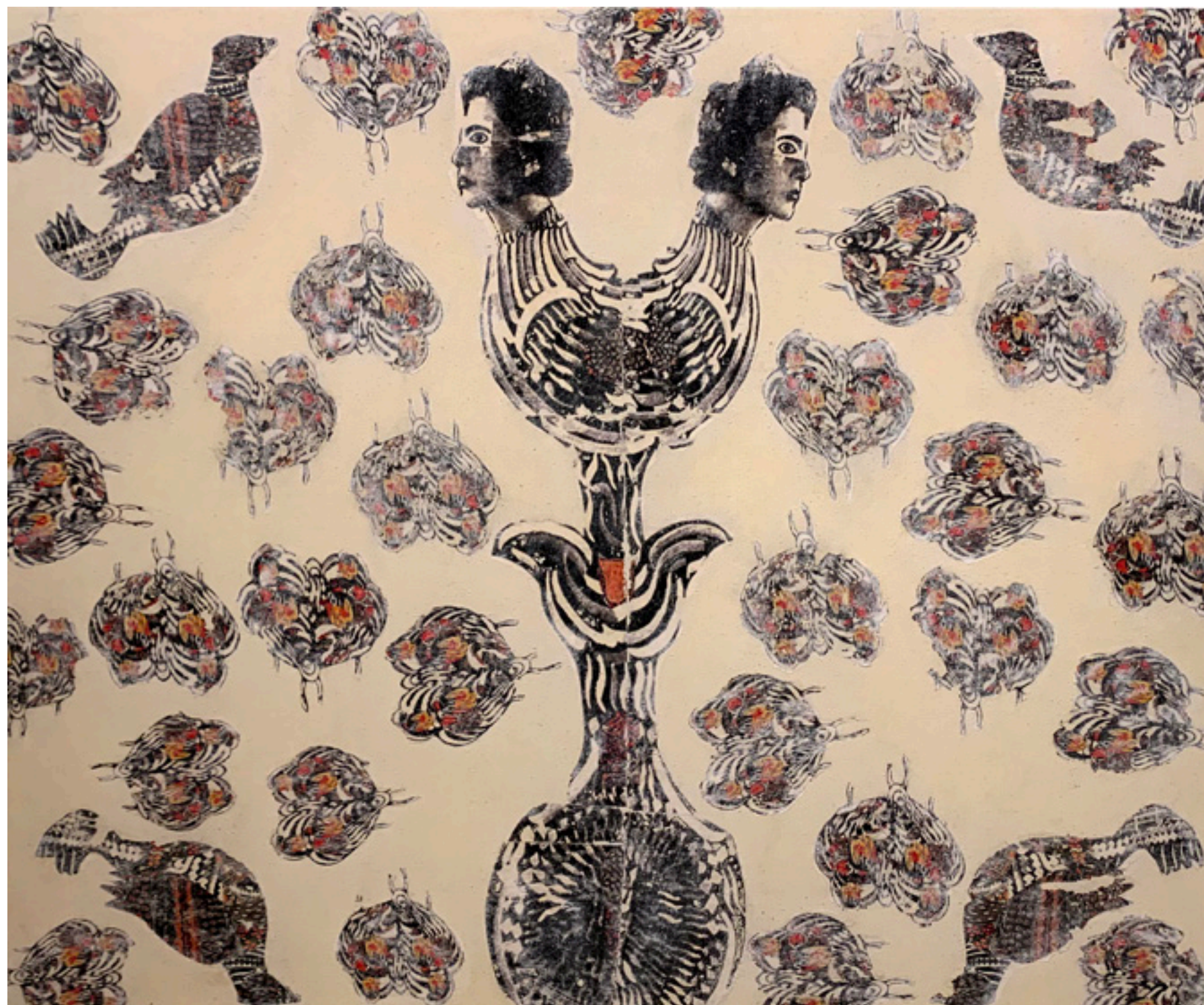
Untitled no. 61 , 2020, printmaking on raw canvas, 41 x 50, $6.500