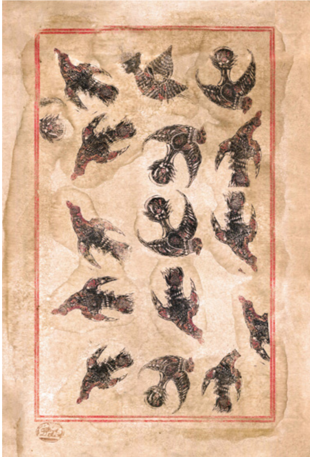
Falling , 2020, printmaking on handmade paper, 13 x 9 in, $2,200