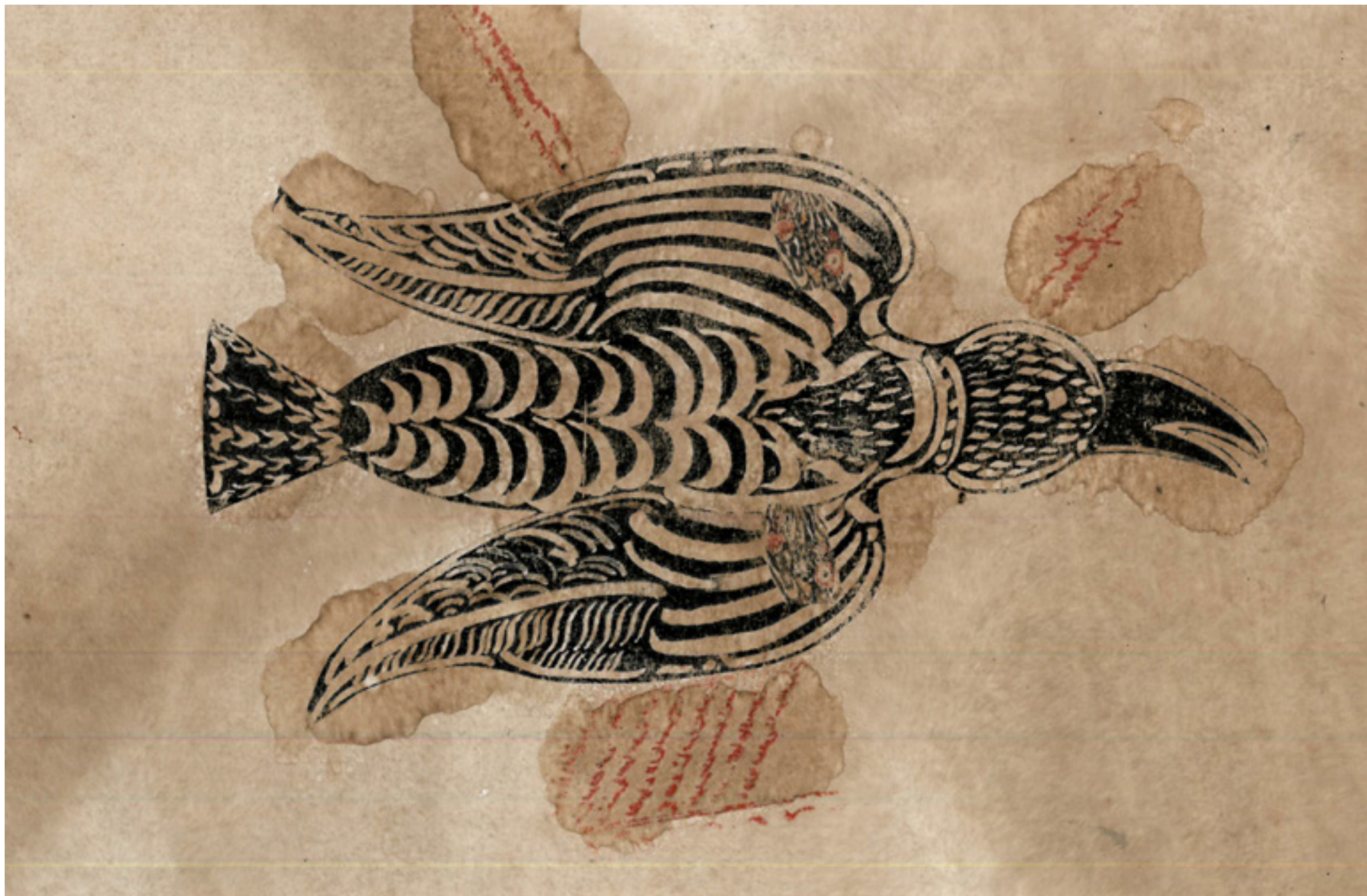
Untitled no. 52 , 2020, printmaking on handmade paper, 8.25 x 11.5 in, $1,800