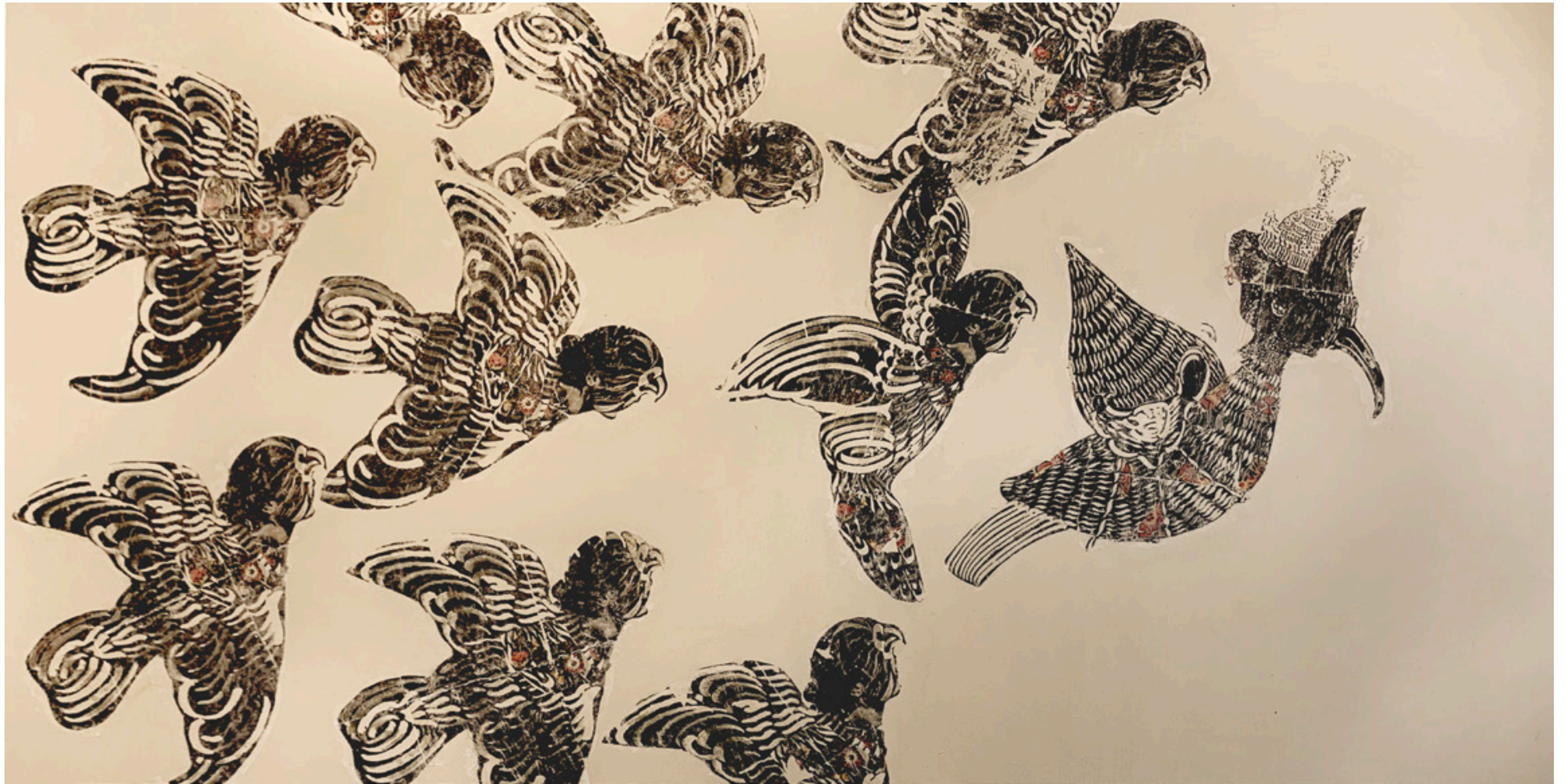
The Conference of the Birds , 2020, printmaking on raw canvas, 63 x 112 in, $17,000