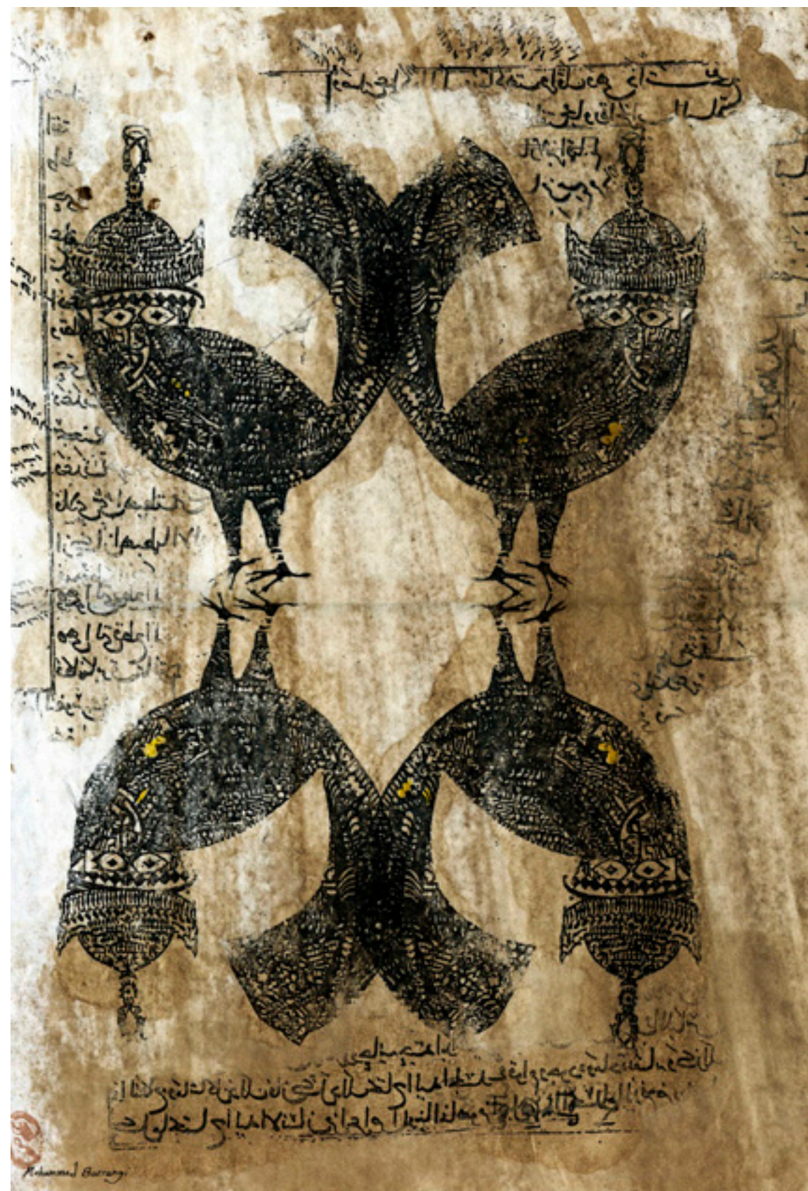
Untitled no. 32, 2020, printmaking on handmade paper, 17.5 x 12 in, $2,500