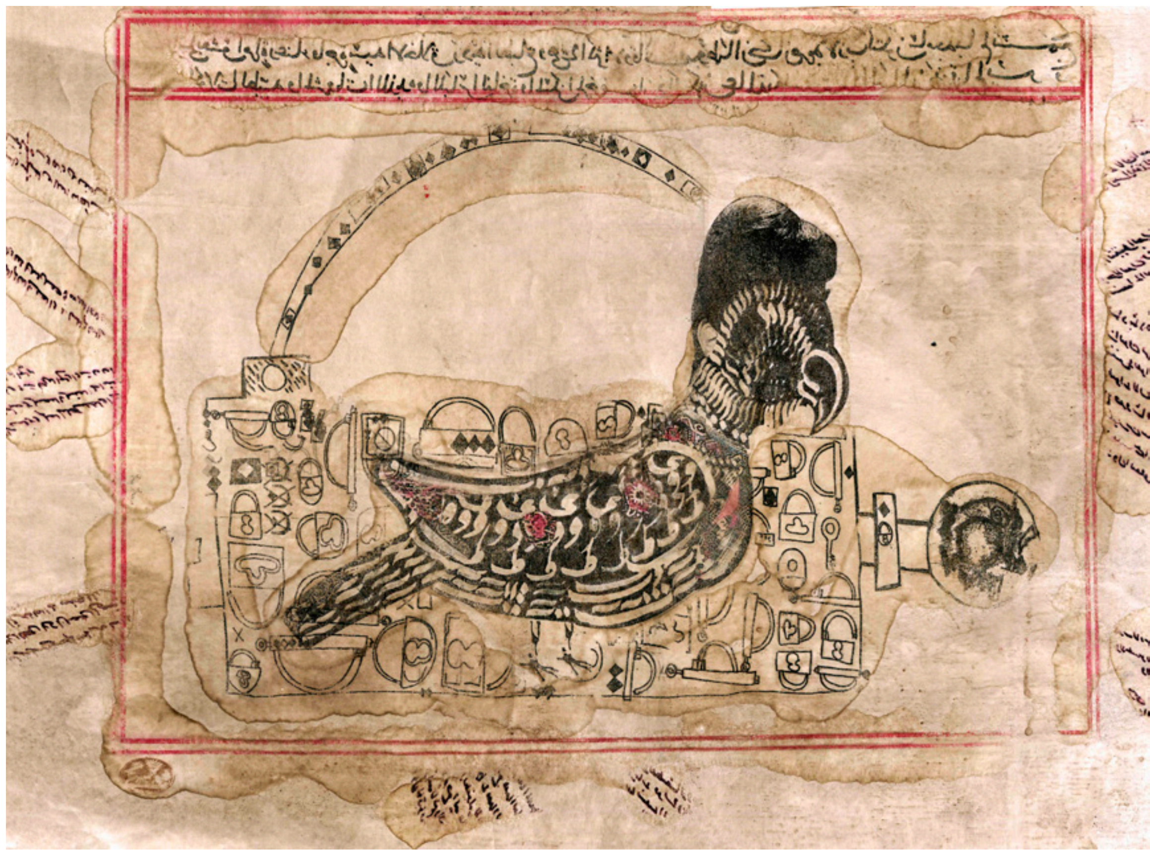
Untitled no. 41, 2020, printmaking on handmade paper, 13.5 x 18.75 in, $3,200