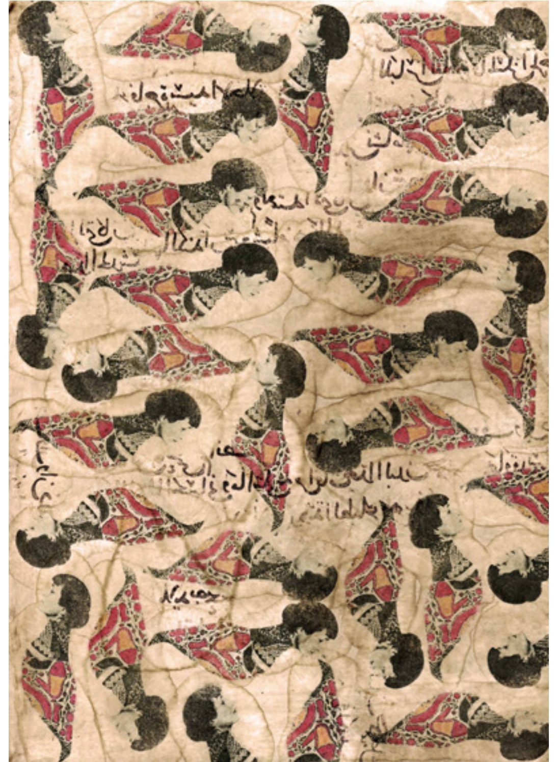
Reveal , 2020, printmaking on handmade paper, 11.75 x 8.5 in, $2,500