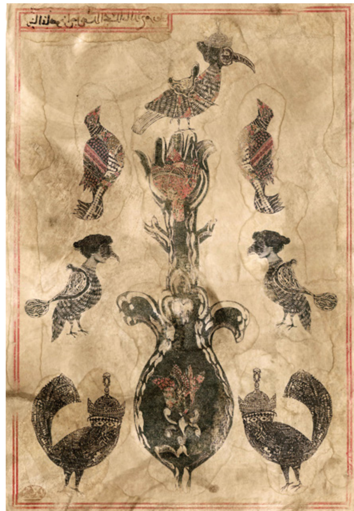
Bird Pyramid, 2019, printmaking on handmade paper, 16.75 x 11.75 in, $3,200