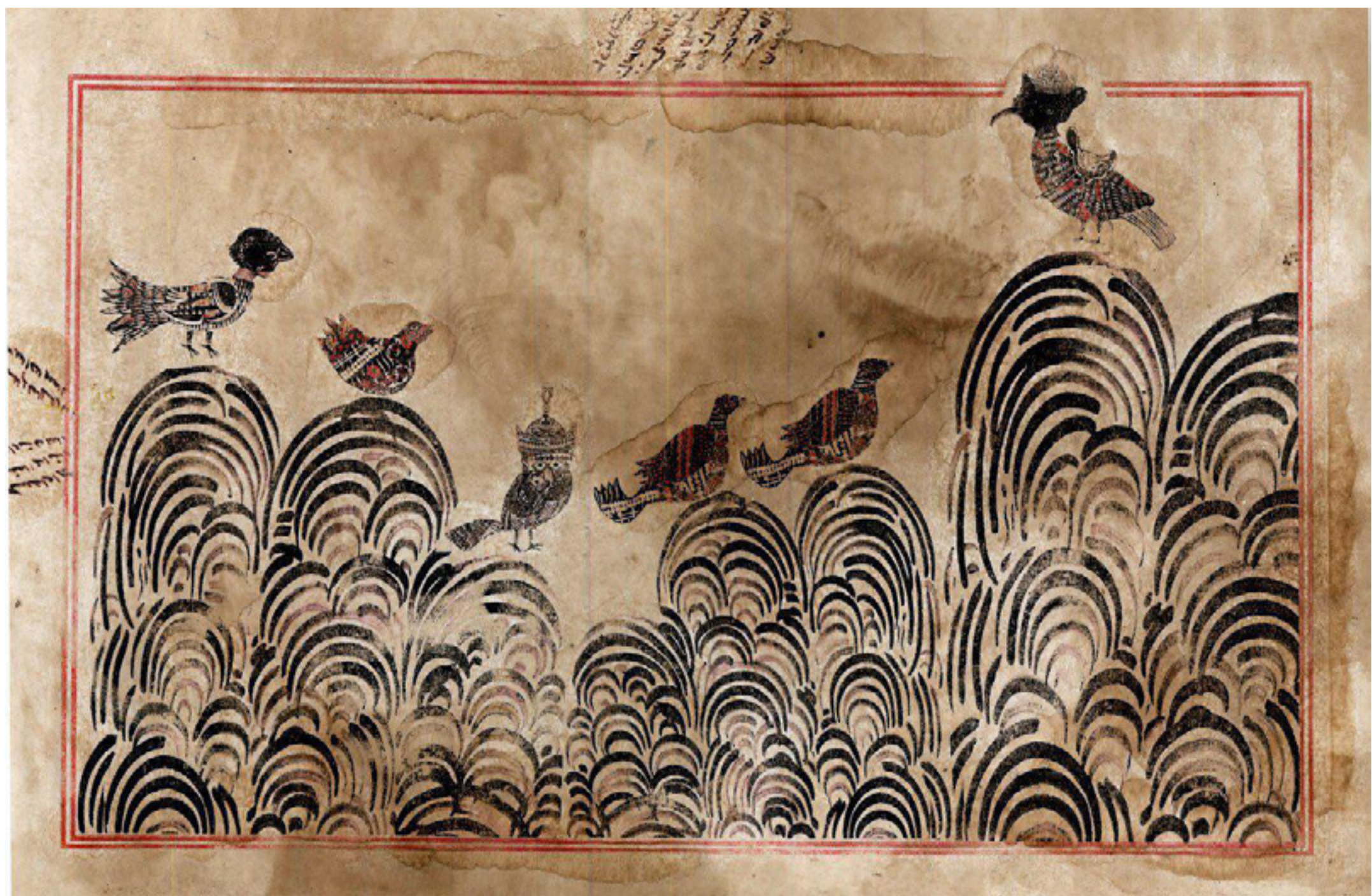
The Conference of the Birds , 2018, printmaking on handmade paper, 12.5 x 19 in, $2,900