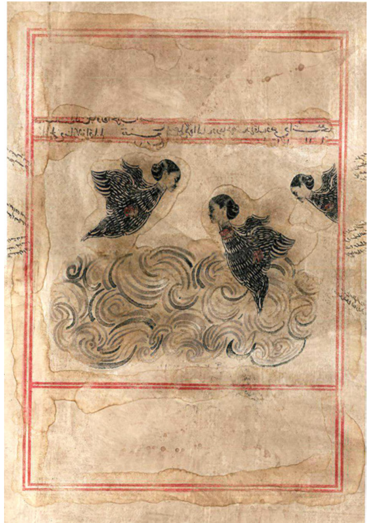
Simorgh Attar, 2018, printmaking on handmade paper, 18.5 x 13.5 in, $3,200