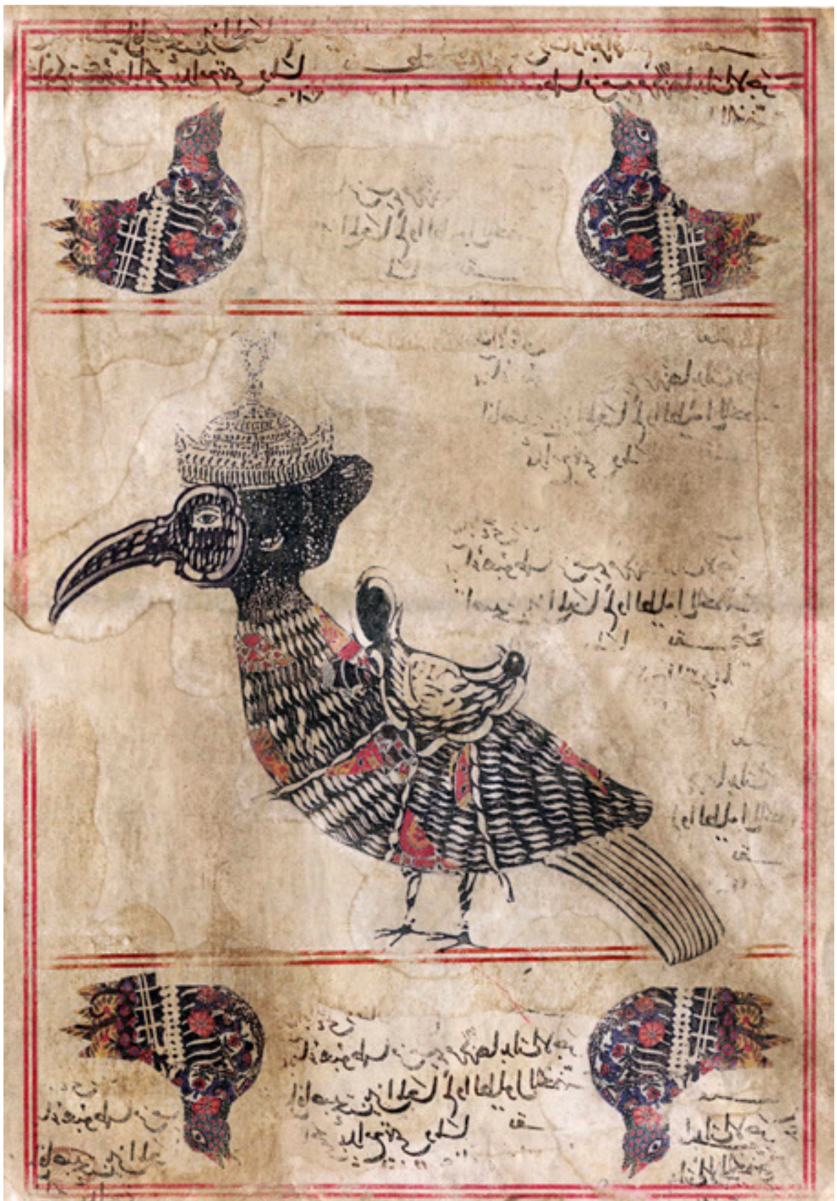
Untitled no. 10, 2020, printmaking on handmade paper, 16.5 x 12 in, $3,200