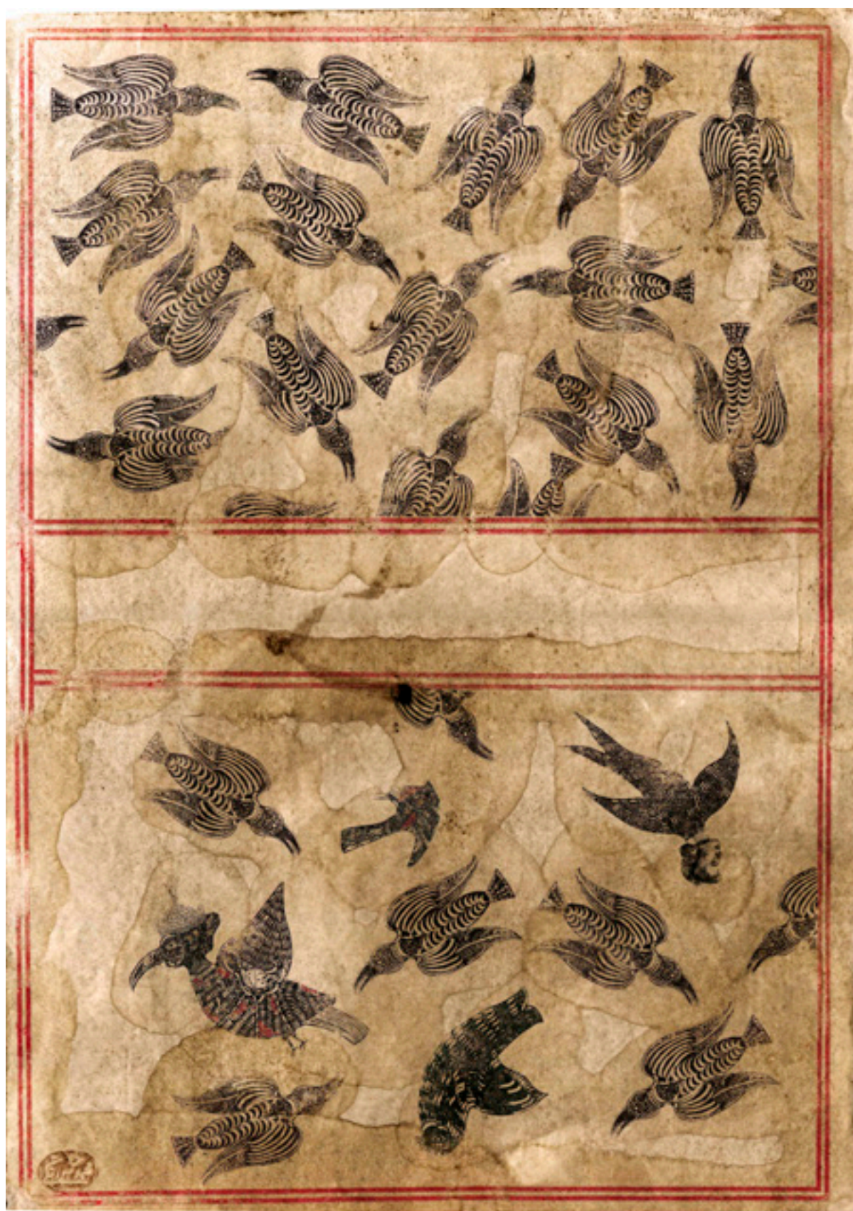
Two Views, 2020, printmaking on handmade paper, 16.5 x 11.5 in, $3,000