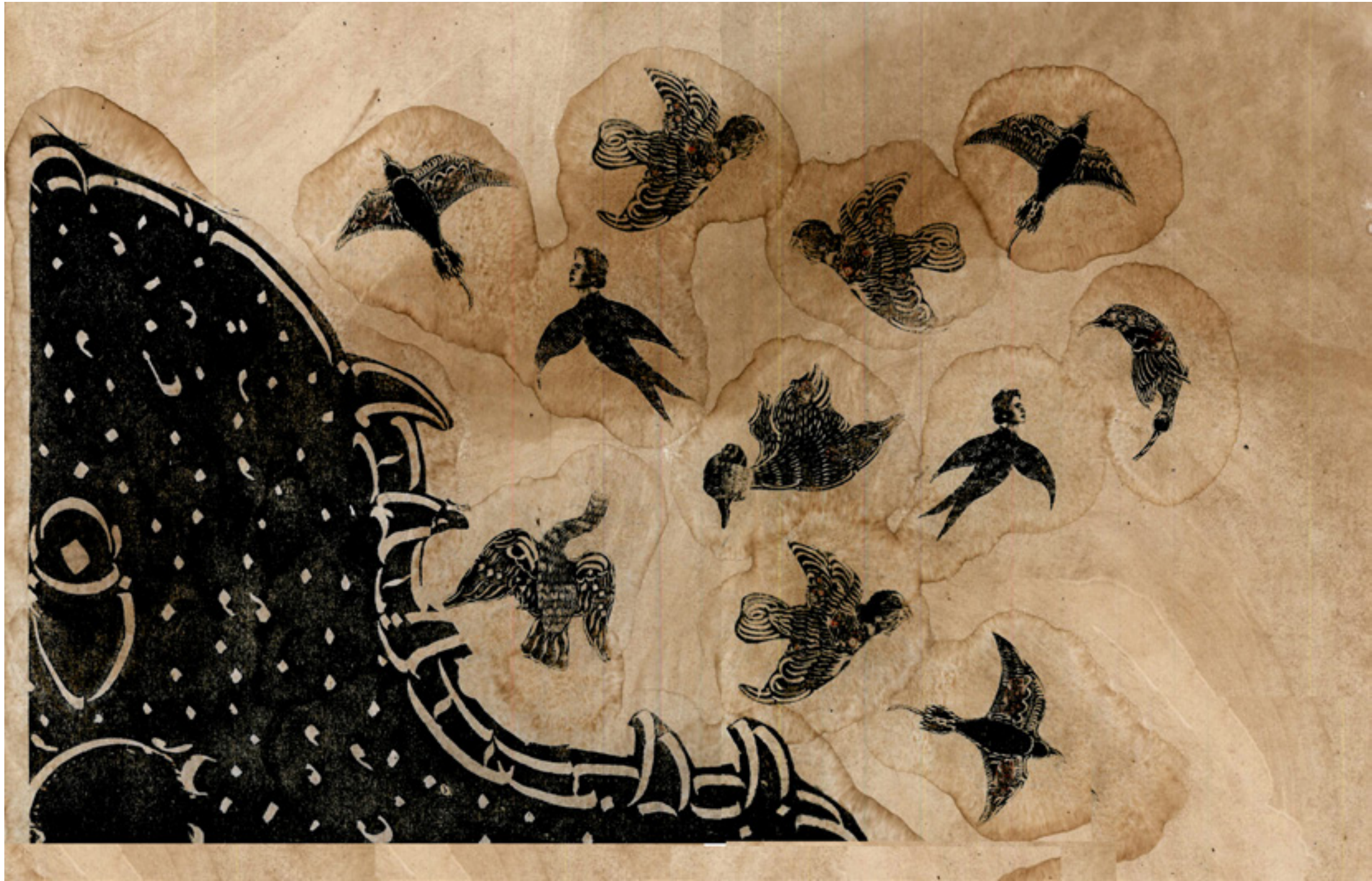
Untitled no. 54, 2020, printmaking on handmade paper, 12.5 x 17.5 in, $2,800