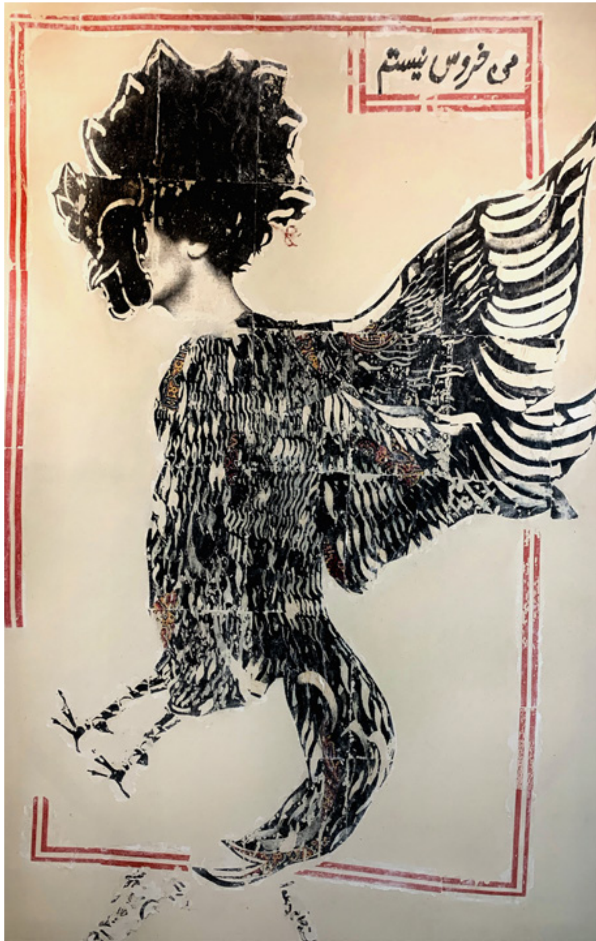
I Am Not a Warrior , 2019, printmaking on raw canvas, 90.50 x 51, $12,000