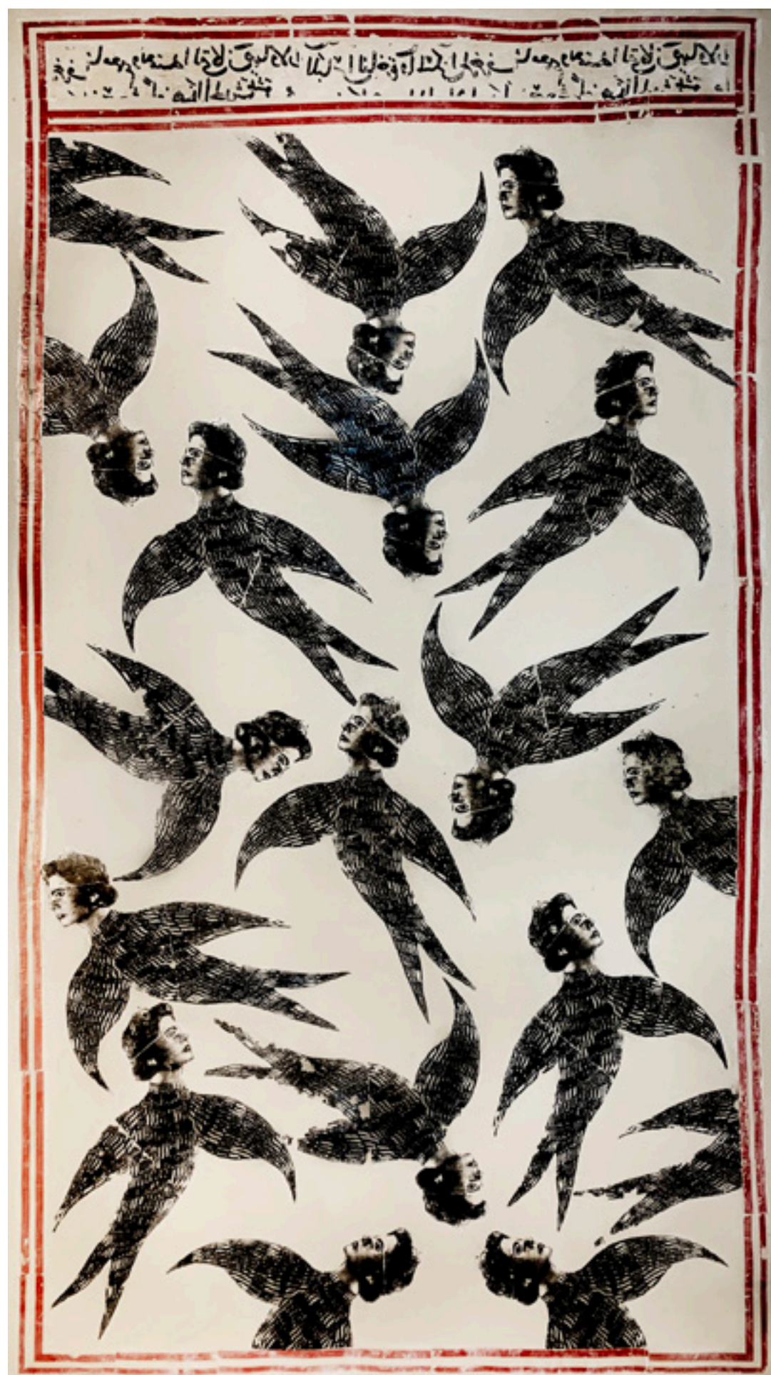
Migration , 2018, printmaking on raw canvas, 106.25 x 63, $15,000