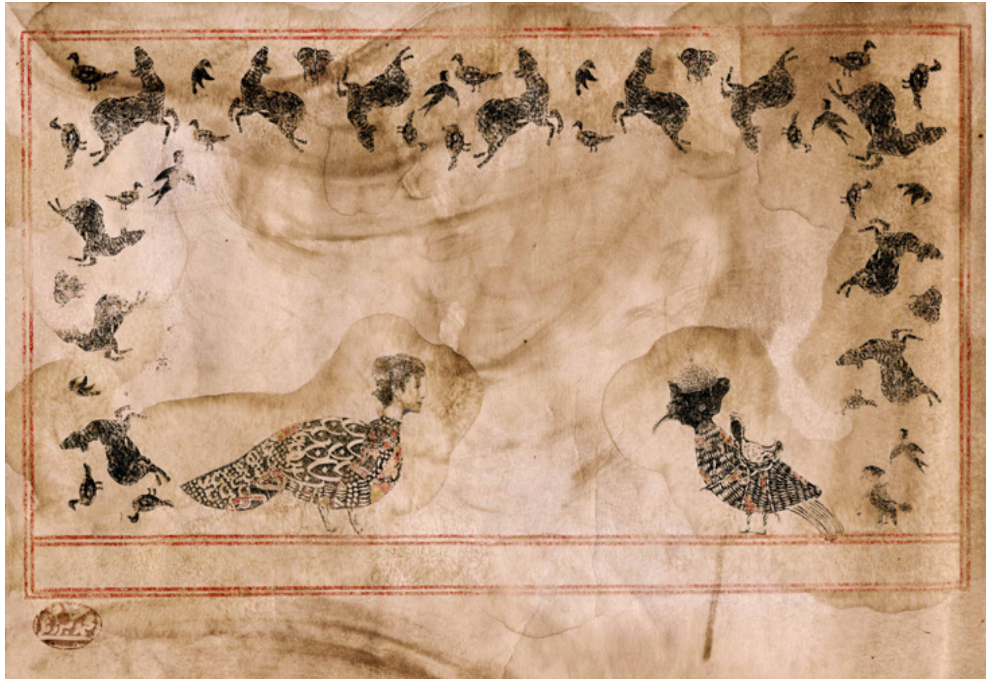
Untitled no. 2, 2020, printmaking on handmade paper, 9.25 x 12 in, $2,000