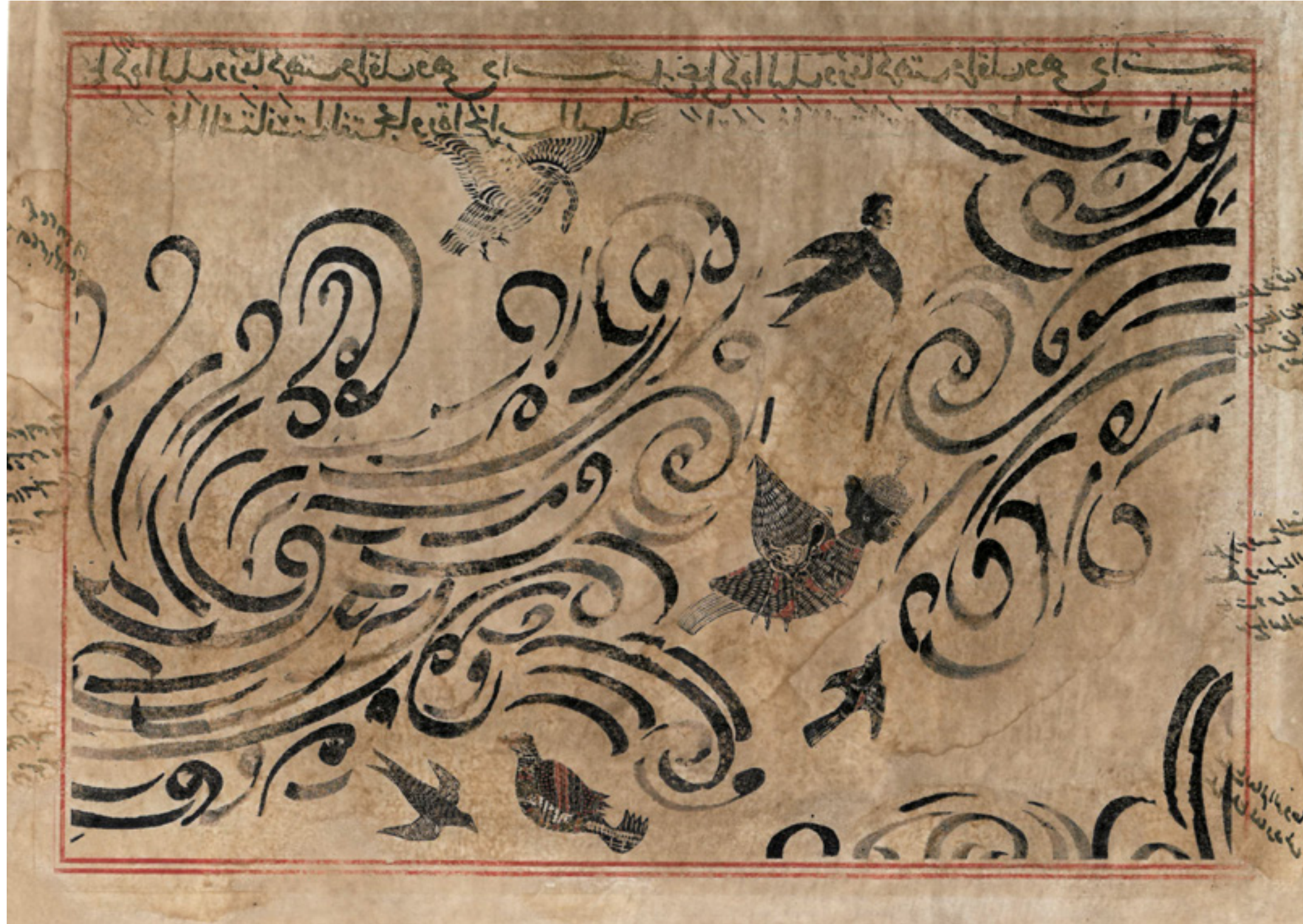
Simorgh Attar, 2018, printmaking on handmade paper, 8.25 x 11.5 in, $2,750