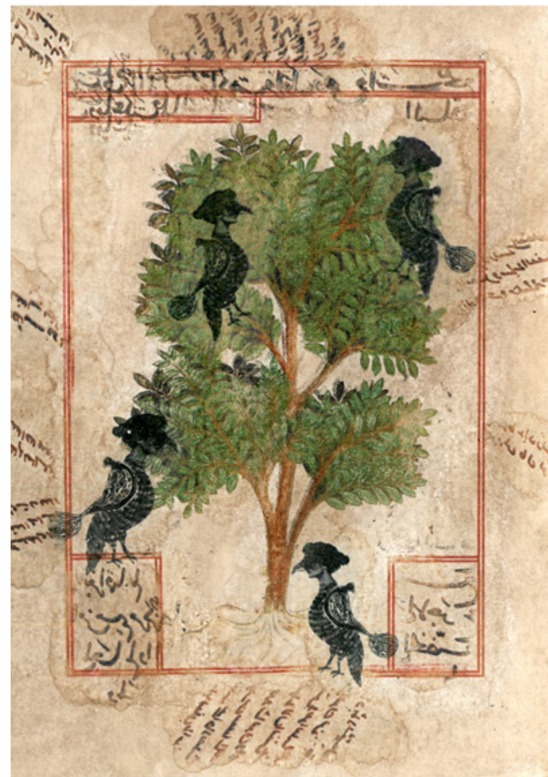
Simorgh Attar, 2019, printmaking on handmade paper, 11.5 x 8.25 in, $2,750