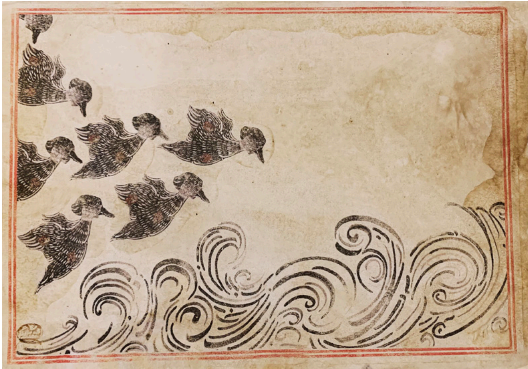
The Conference of the Birds , 2020, printmaking on handmade paper, 12 x 17 in, $2,900