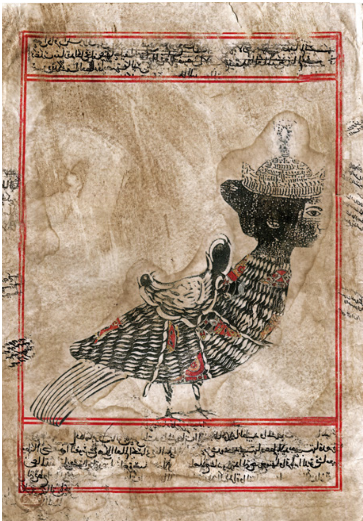
Saddle Up, 2020, printmaking on handmade paper, 18 x 12.5 in, $3,500