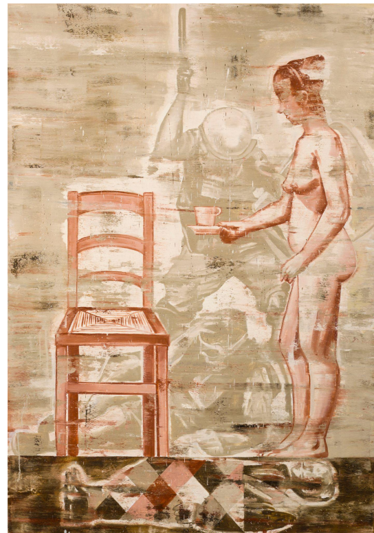
L: Tale of the Lost Dream , 2022. Oil on canvas. 85 x 65 in R: Tear Gas and Tea in the Afternoon , 2012. Oil on canvas. 72 x 50 in.