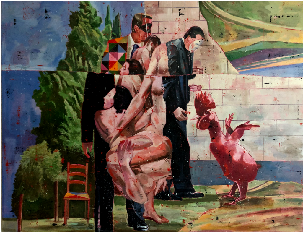
Let's Talk , 2020. Oil on canvas, 65 x 85 in.

Let's Talk opens to the public Saturday, December 9th, 2023, 5-9pm at ADVOCARTSY's West Hollywood gallery, Located at 434 North La Cienega Blvd, Los Angeles, CA 90048