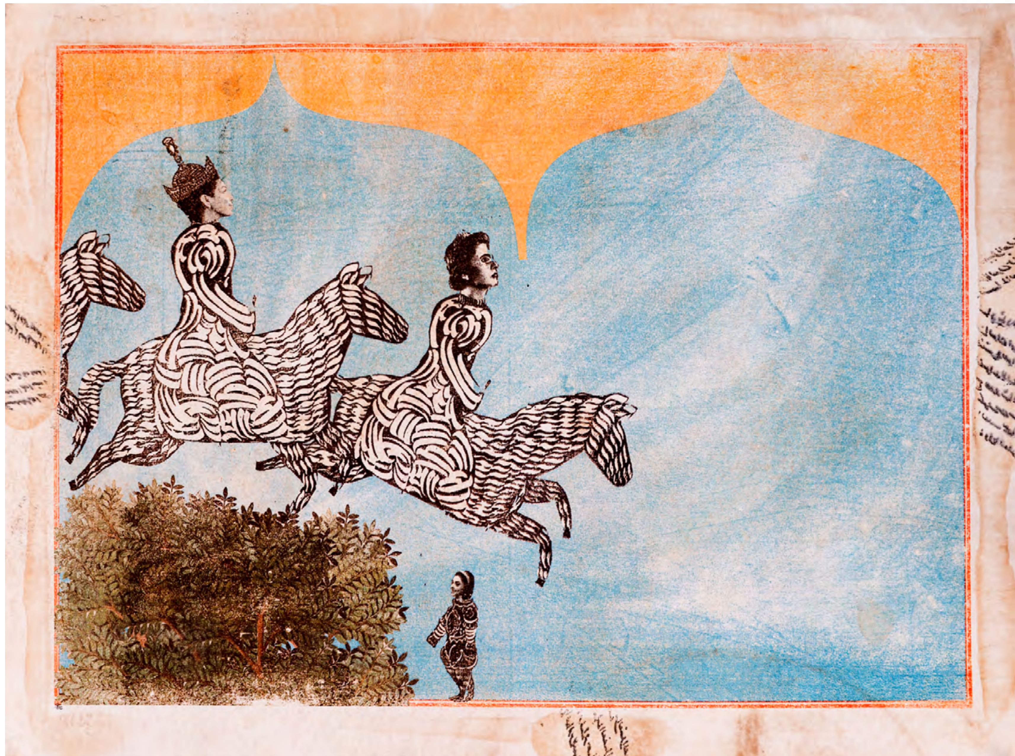
Fantasyland #12, 2022 Reverse transfer printmaking on handmade paper 13.5 x 18.25 in