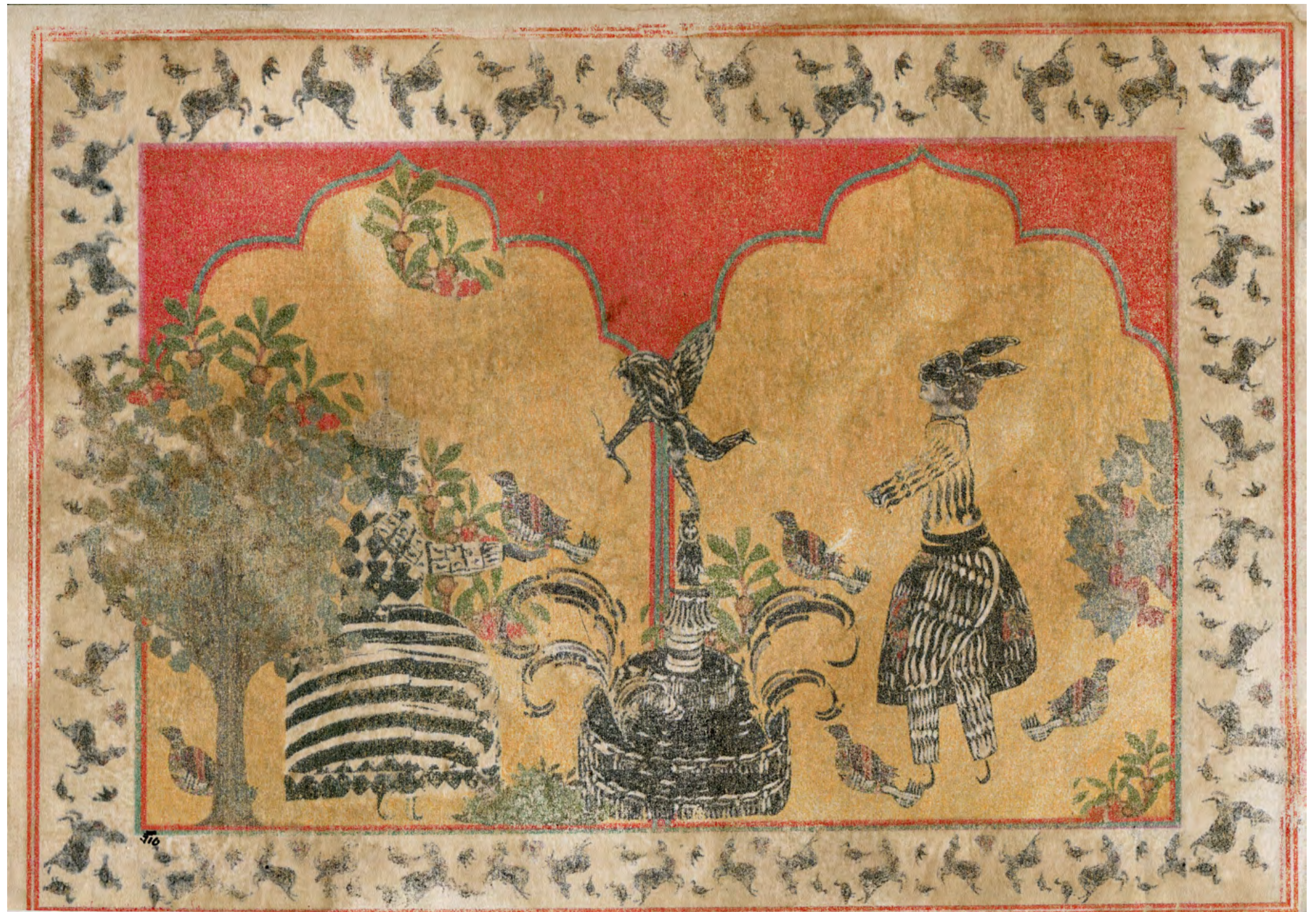
Fantasyland #20, 2022 Reverse transfer printmaking on handmade paper 11.75 x 8.5 in