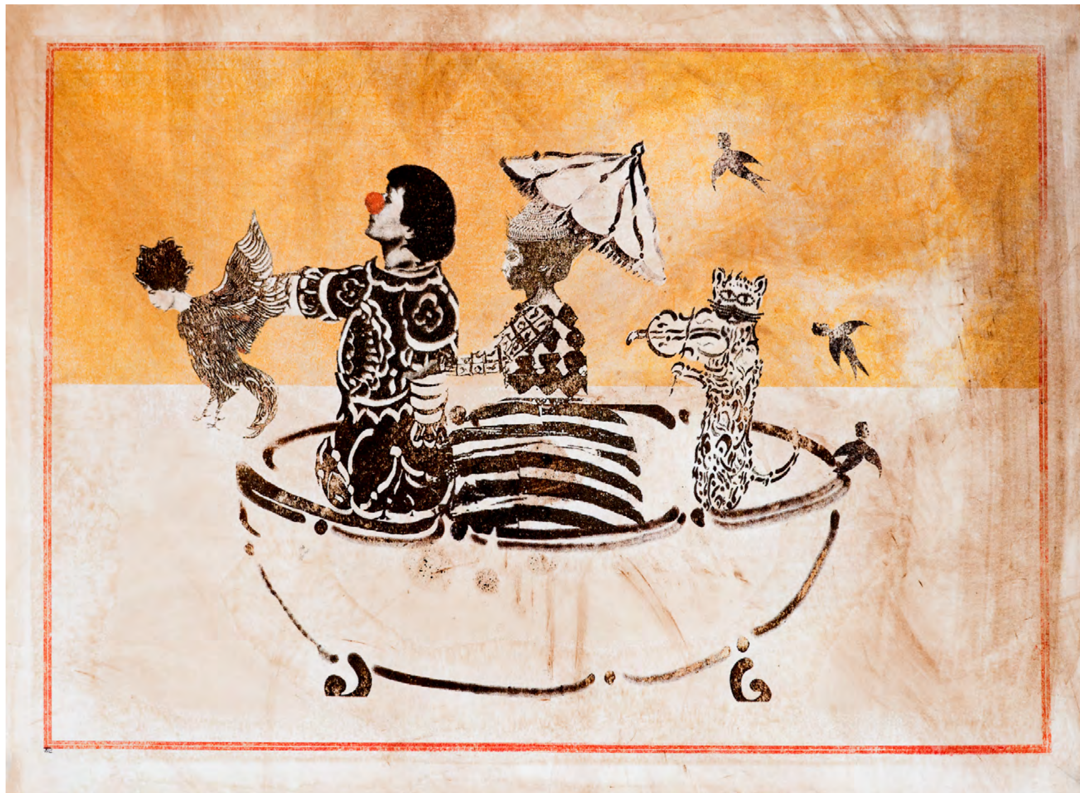
Fantasyland #5, 2022 Reverse transfer printmaking on handmade paper 13 x 17.75 in