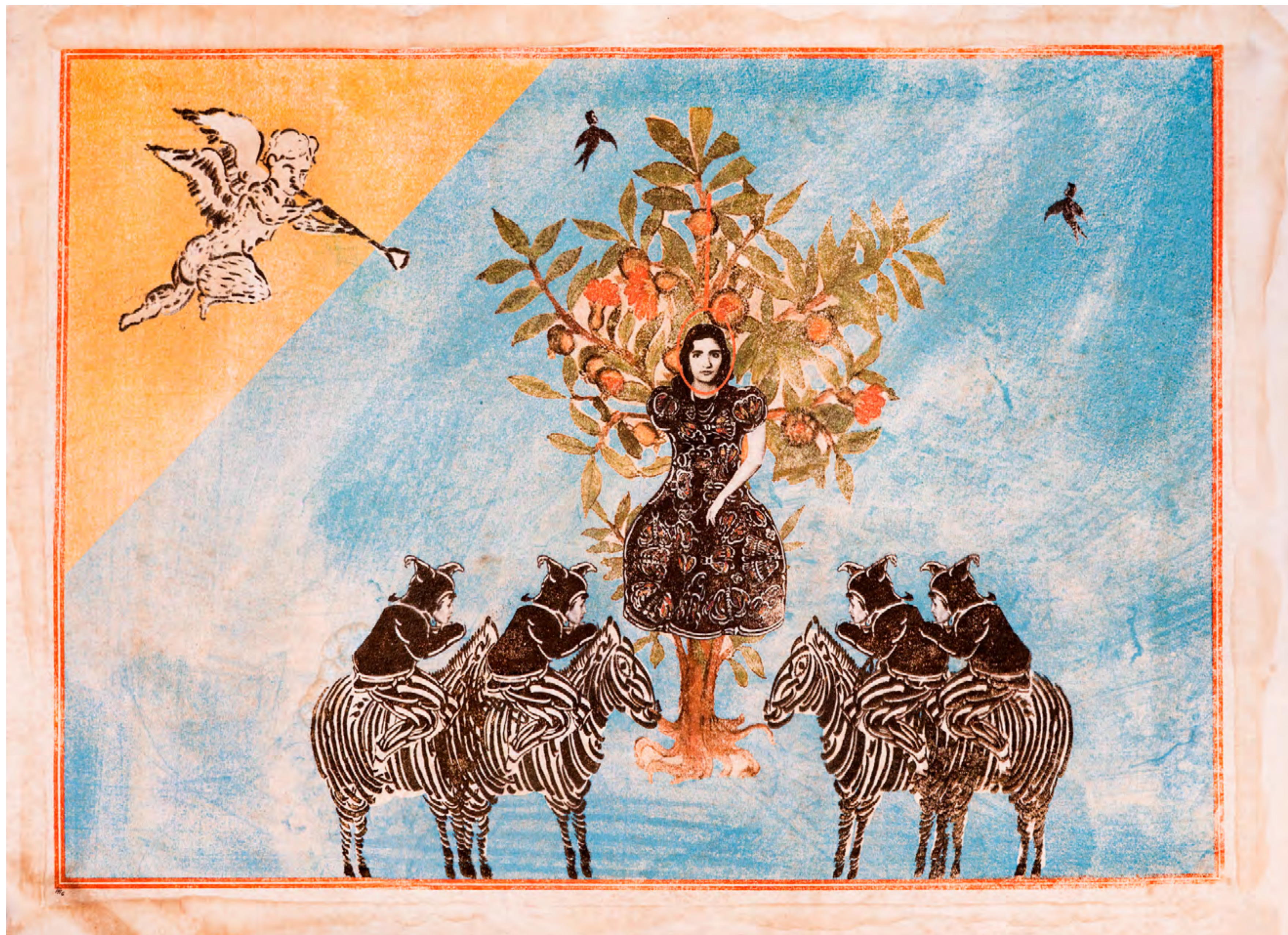
Fantasyland #9, 2022 Reverse transfer printmaking on handmade paper 13 x 18 in