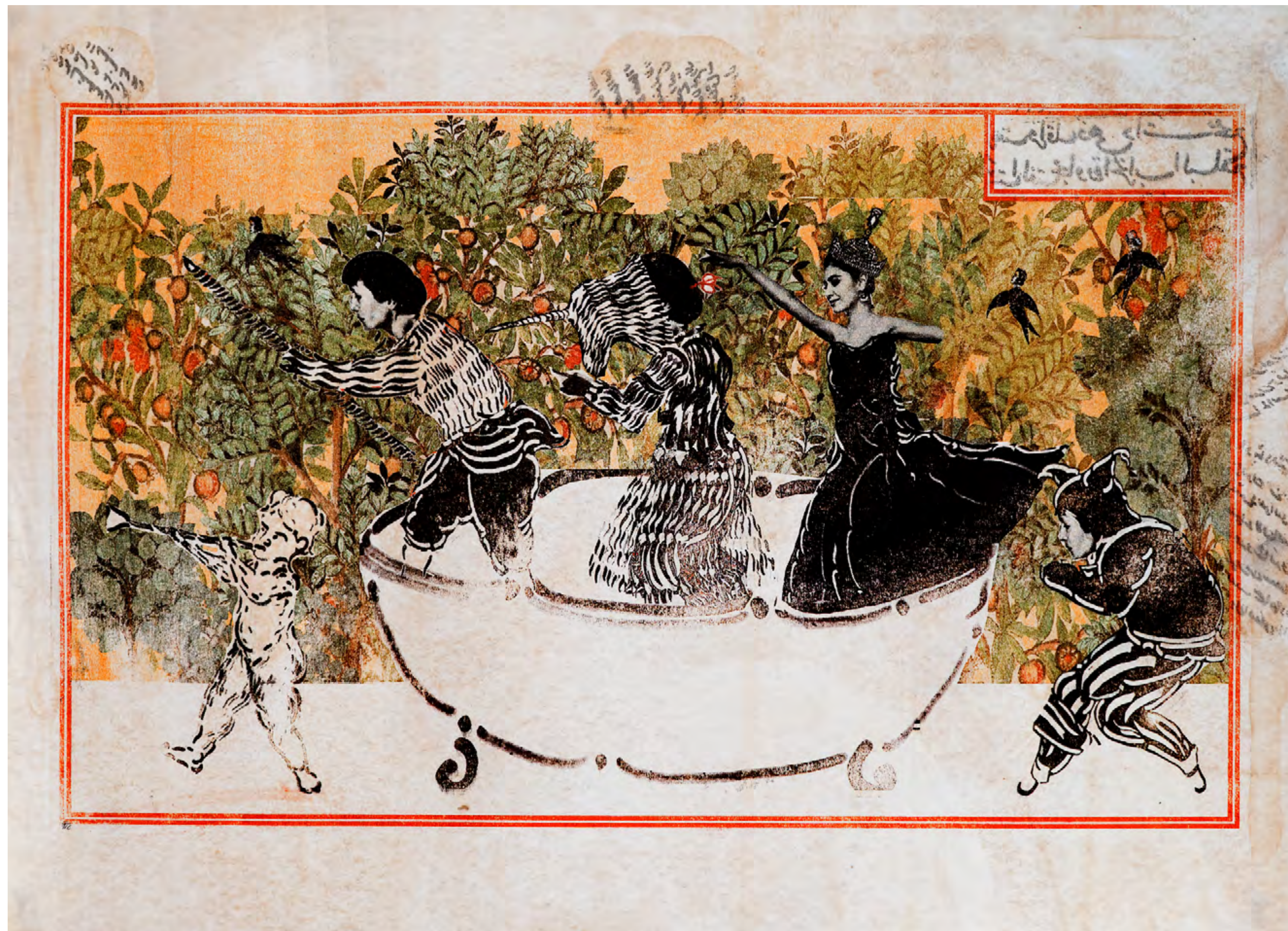
Fantasyland #6, 2022 Reverse transfer printmaking on handmade paper 12.75 x 17.75 in