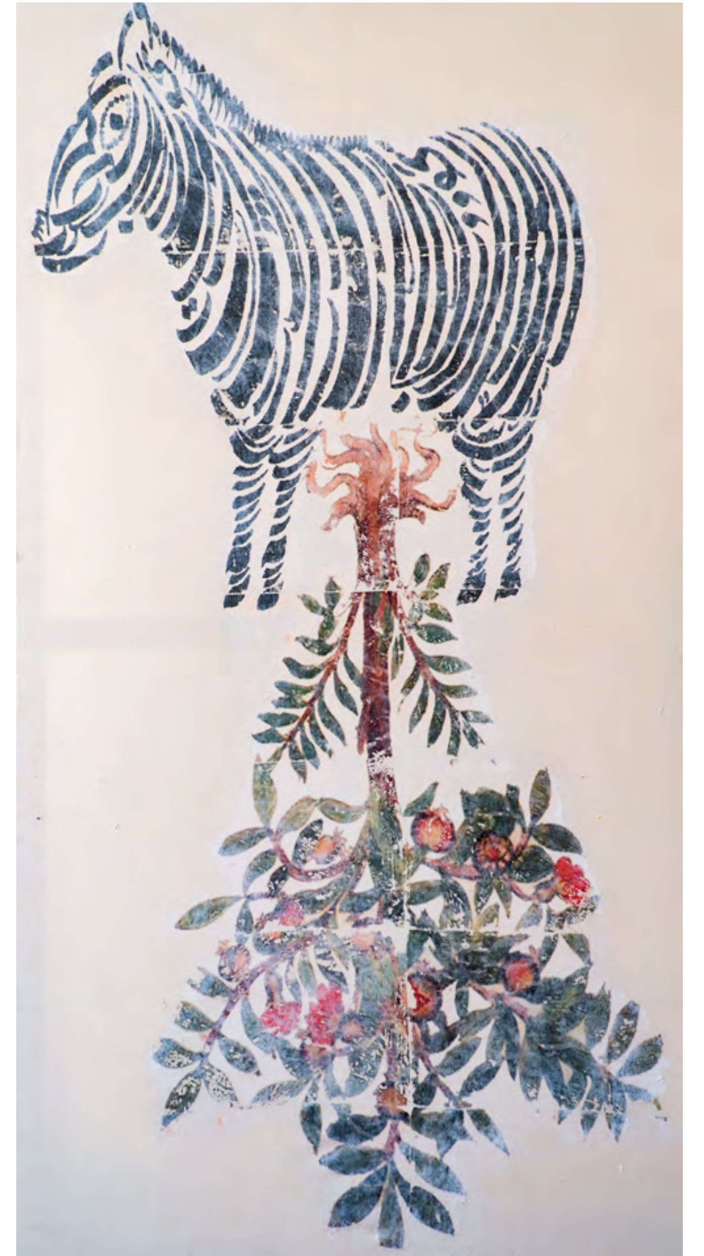
Birth of the Pomegranate Tree (Dreamscape #7), 2022 Reverse transfer printmaking on raw canvas 80 x 42.5 in