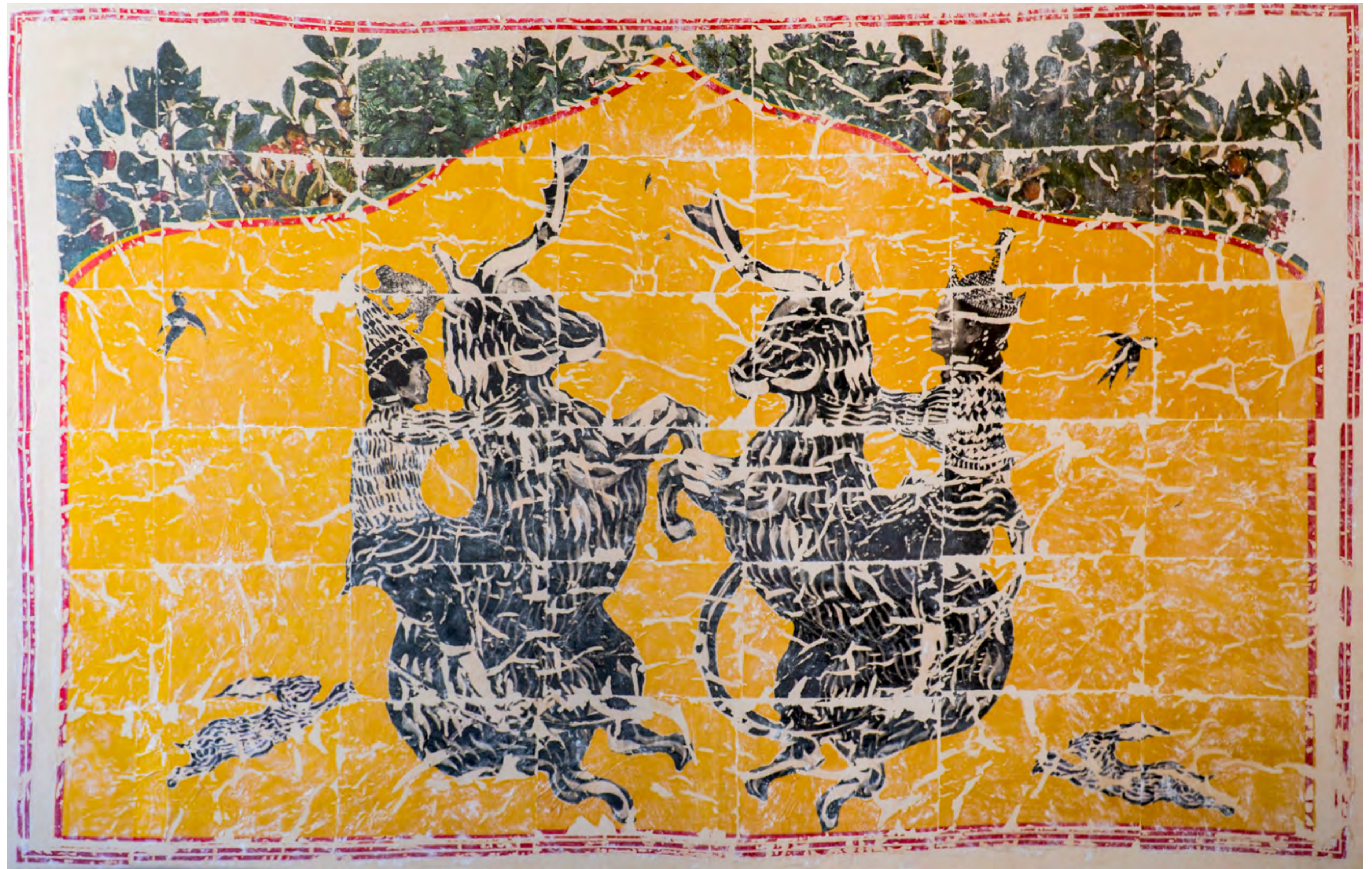
Quest of the Sun's Children (Dreamscape #5) , 2022 Reverse transfer printmaking on raw canvas 72.25 x 113 in