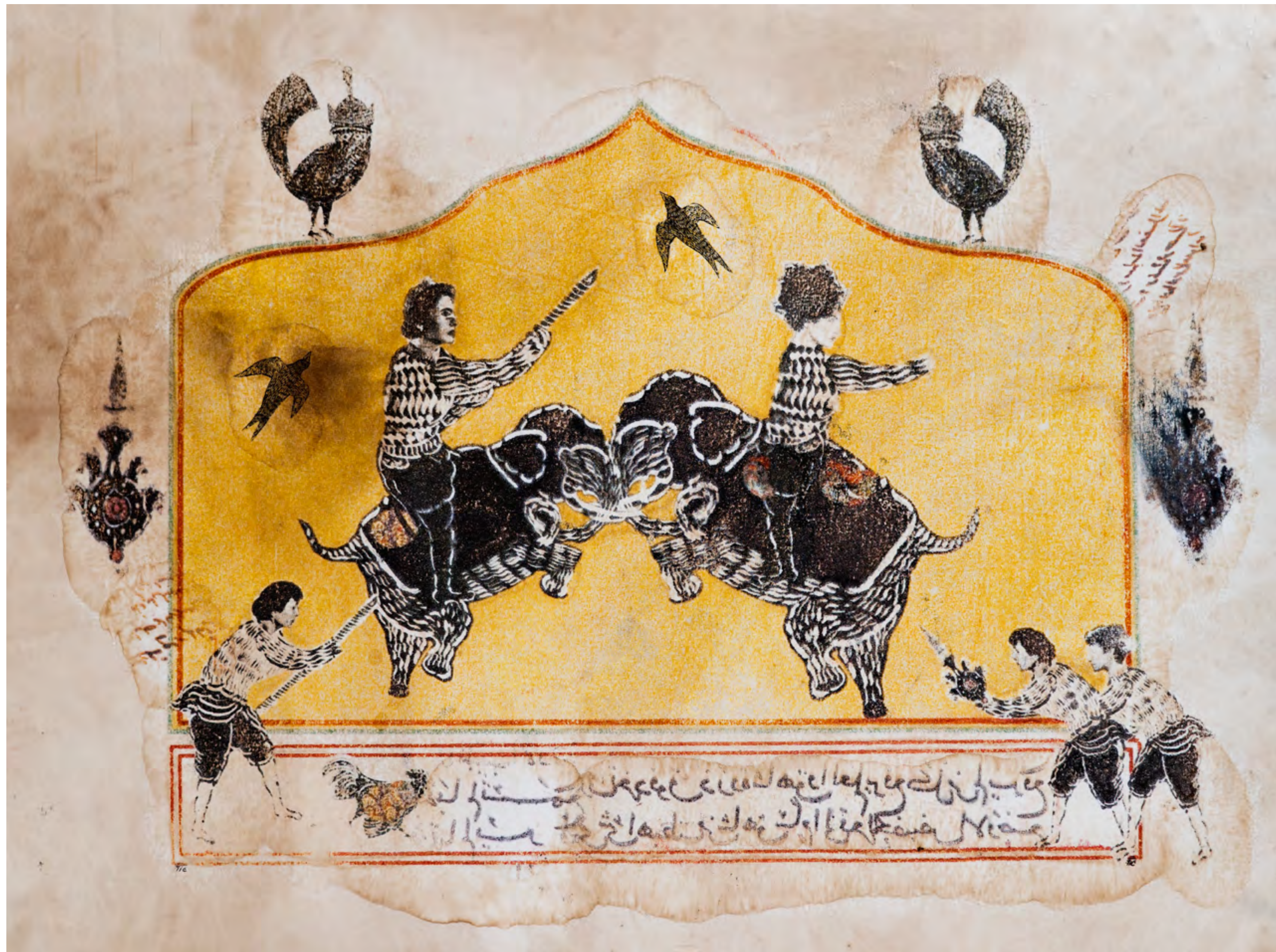
Fantasyland #35, 2022 Reverse transfer printmaking on handmade paper 12.25 x 16.5 in