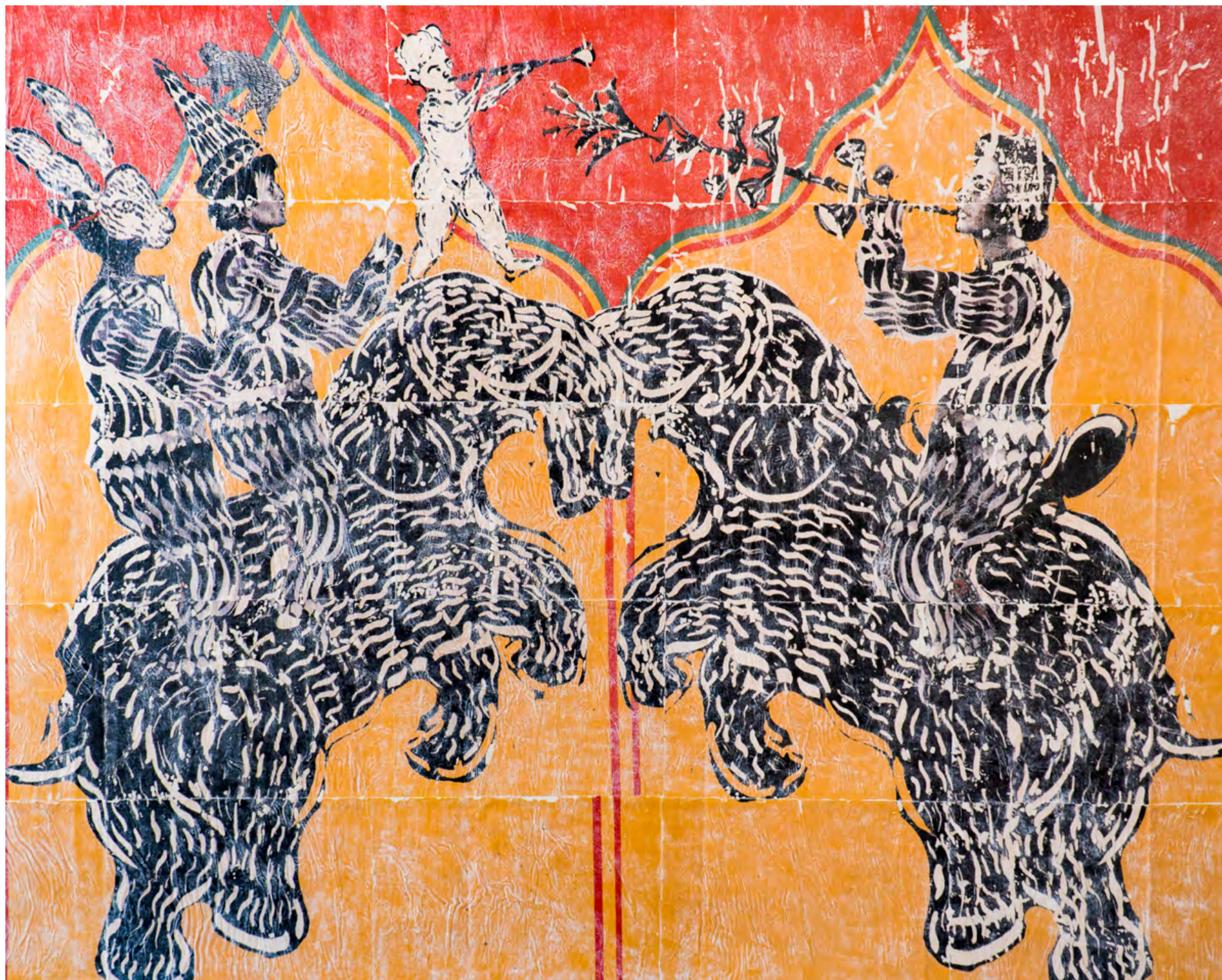
While Everyone Slept (Dreamscape #3) , 2022 Reverse transfer printmaking on raw canvas 55.25 x 69.25 in