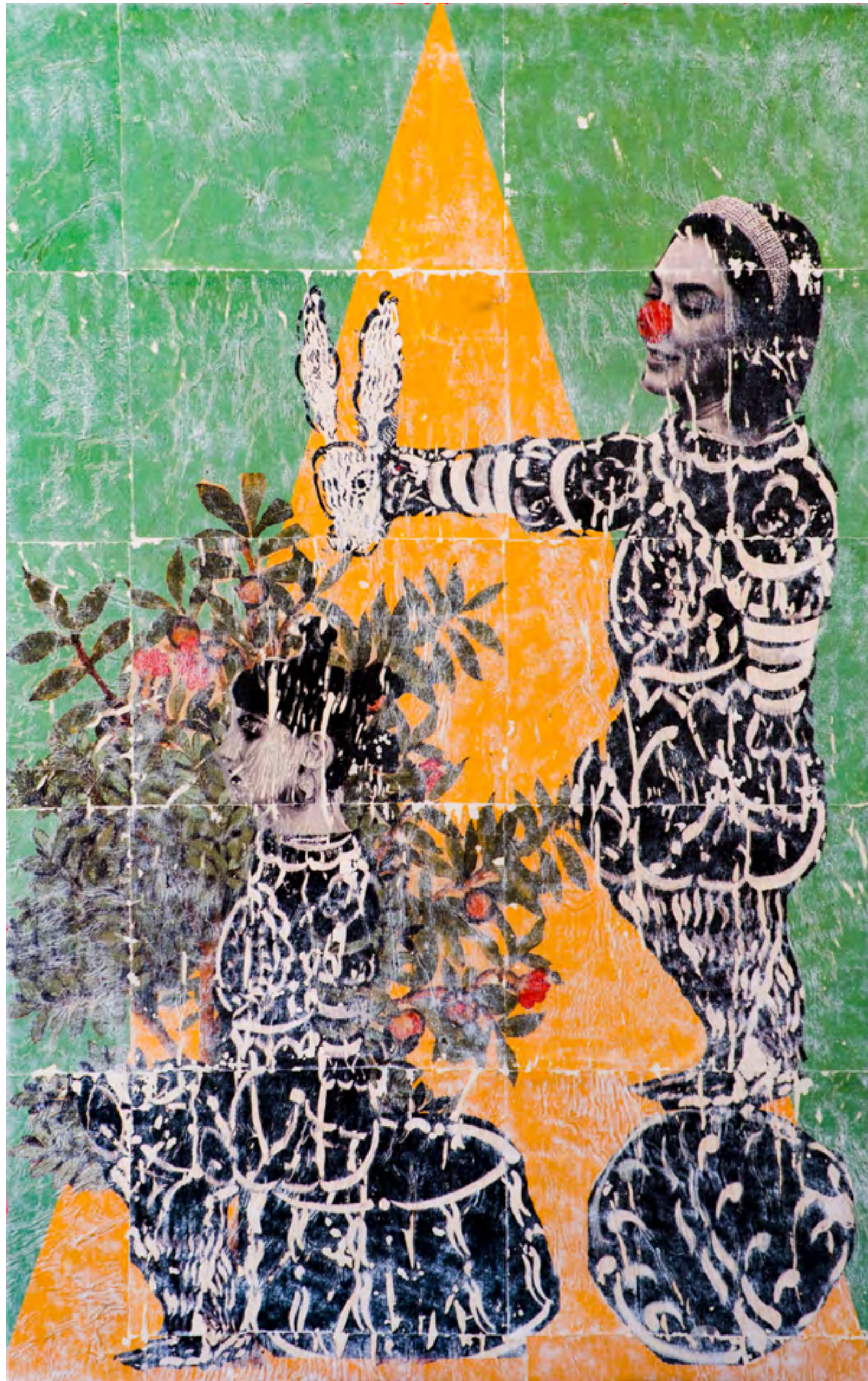
Shahrazad in the Garden (Dreamscape #2) , 2022 Reverse transfer printmaking on raw canvas 58.25 x 36.5 in