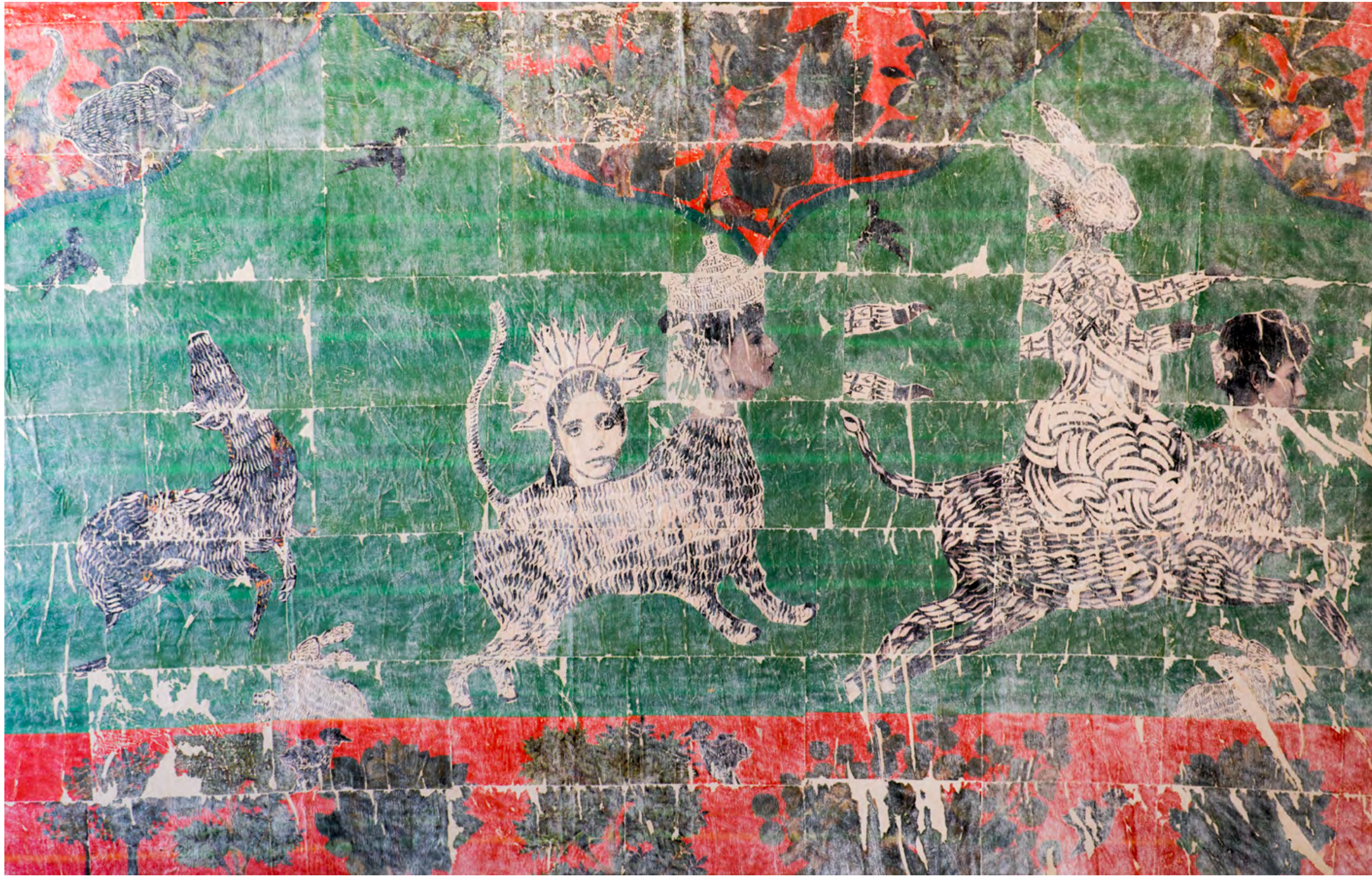
Guardians of Eden (Dreamscape #8) , 2022 Reverse transfer printmaking on raw canvas 74 x 116 in