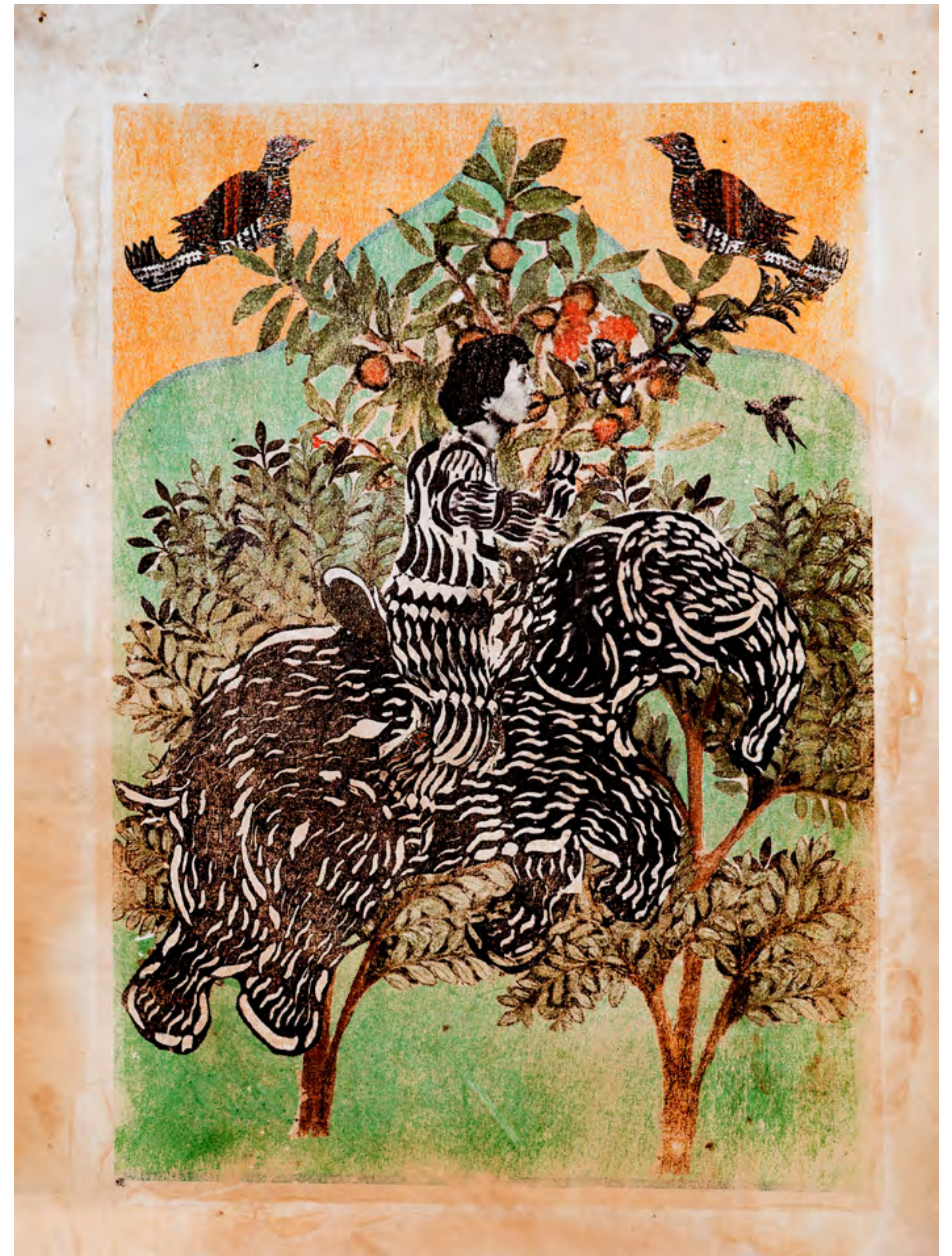
Fantasyland #8, 2022 Reverse transfer printmaking on handmade paper 19 x 14 in