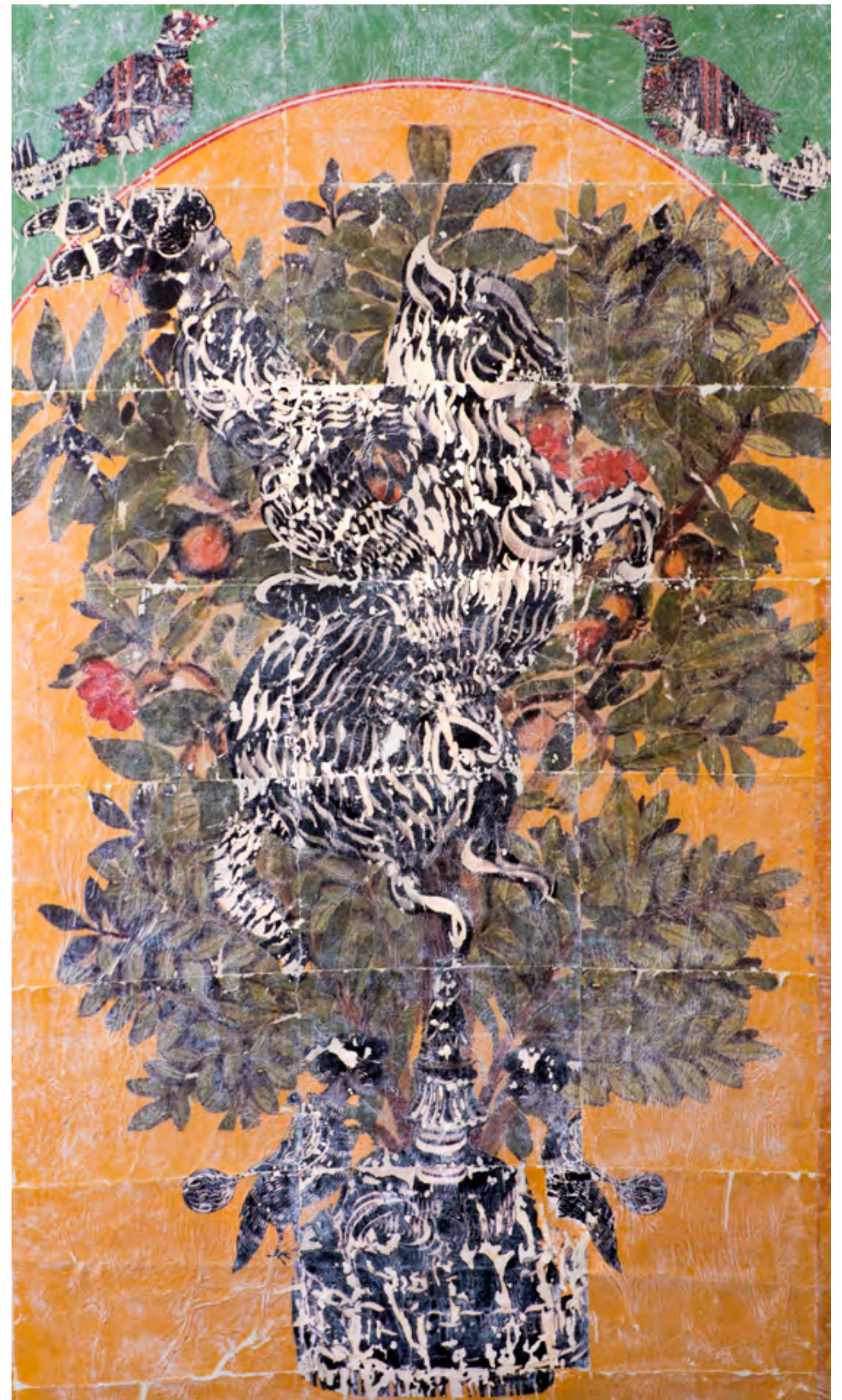
Mask of the Rabbit & the Galloping Horse (Dreamscape #1), 2022 Reverse transfer printmaking on raw canvas 79.25 x 46.5 in