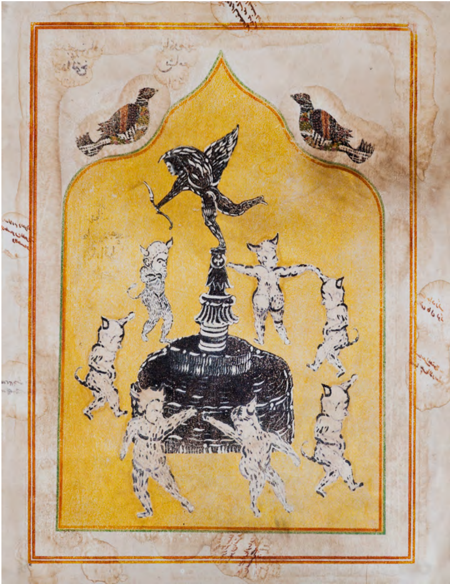
Fantasyland #34, 2022, Reverse transfer printmaking on handmade paper, 17.5 x 13.5 in