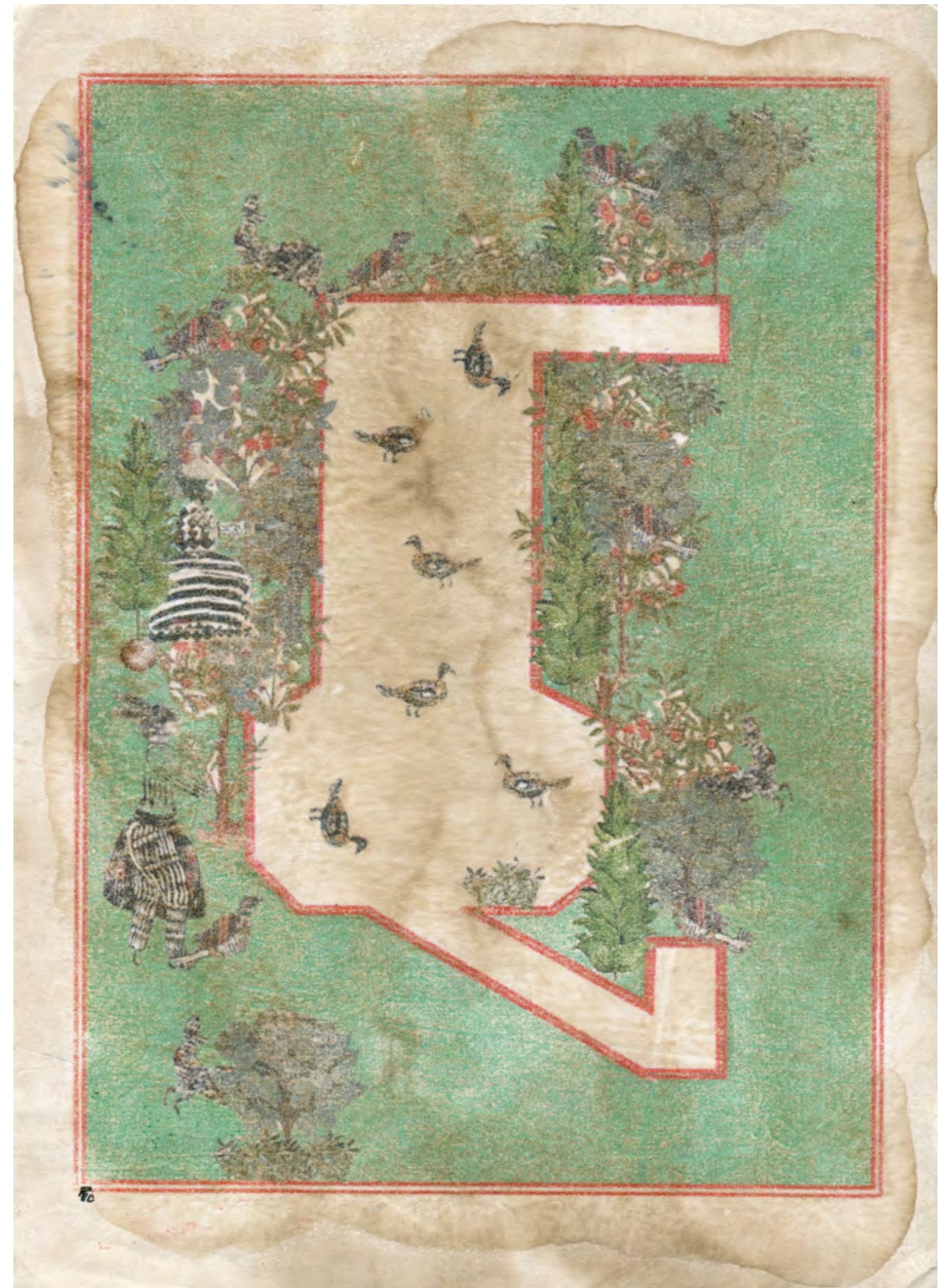
Fantasyland #23 , 2022, Reverse transfer printmaking on handmade paper, 11.75 x 8.5 in