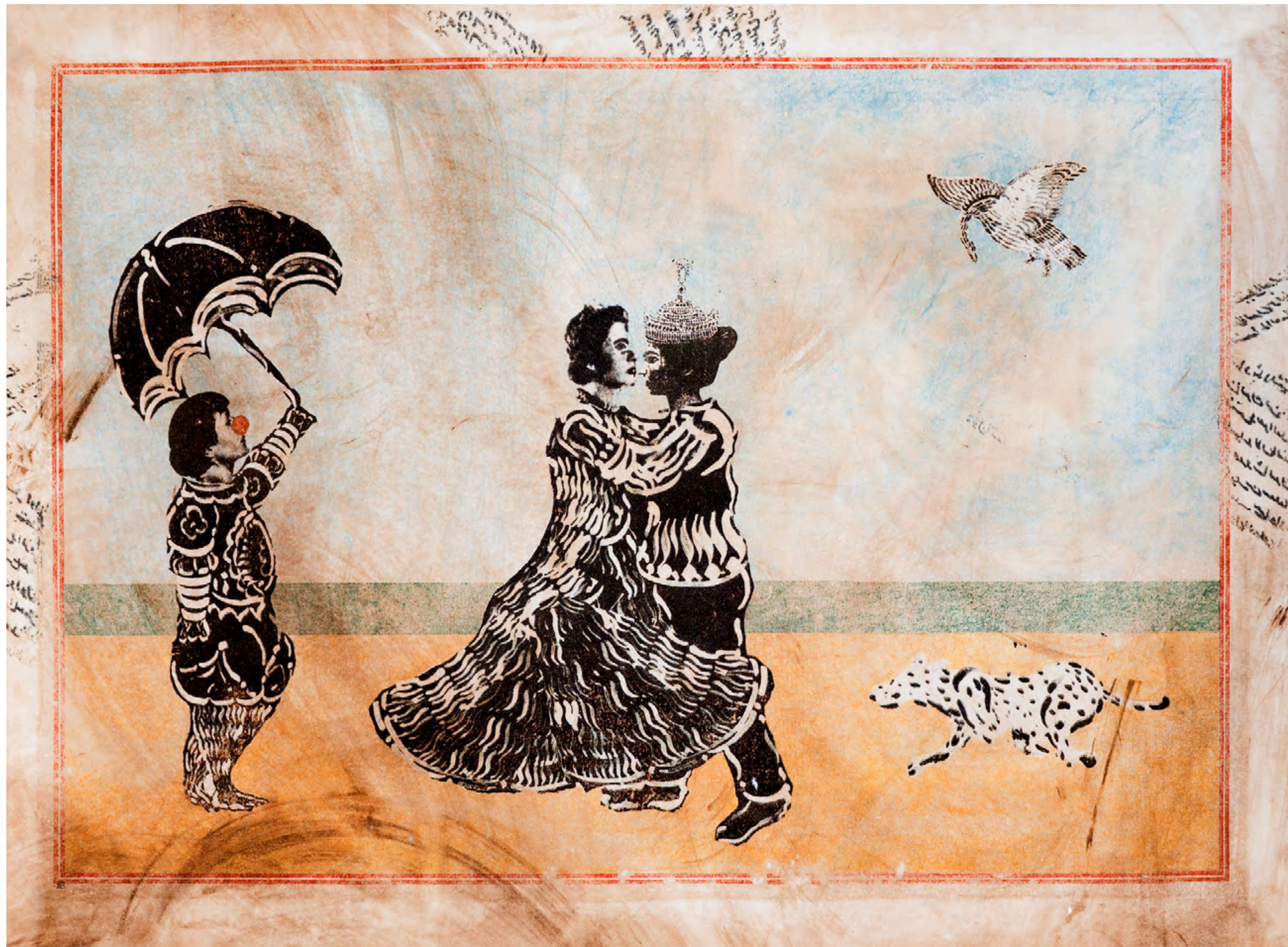
Fantasyland #4, 2022 Reverse transfer printmaking on handmade paper 13 x 17.75 in