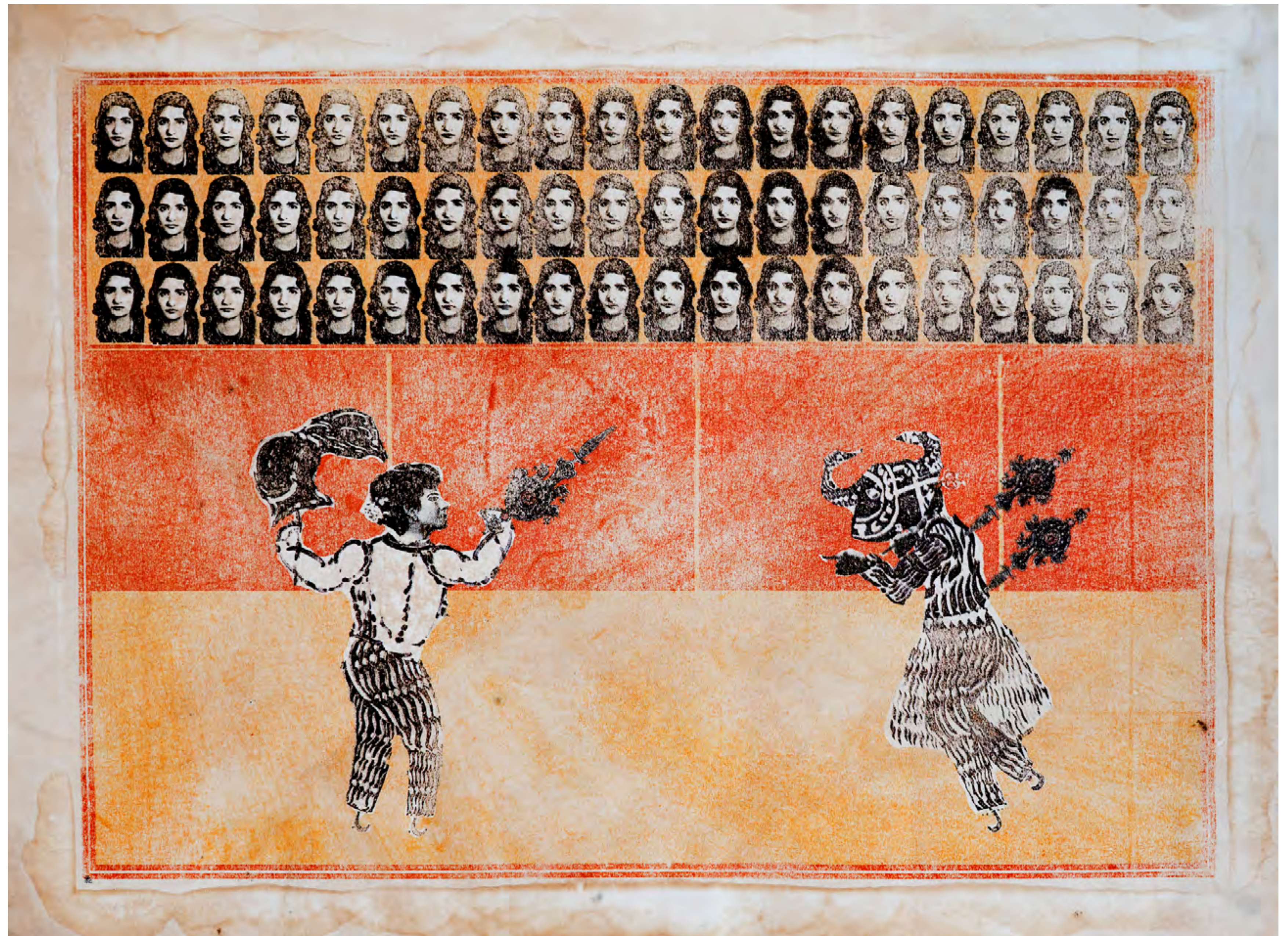
Fantasyland #10, 2022 Reverse transfer printmaking on handmade paper 13.25 x 18 in