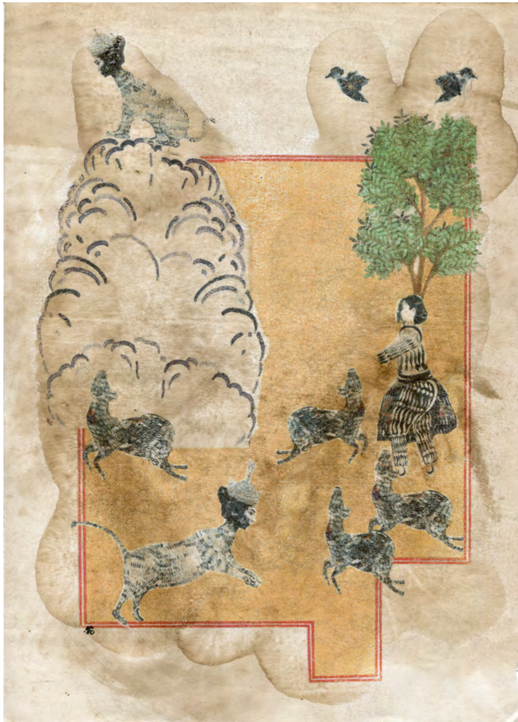
Fantasyland #21 , 2022, Reverse transfer printmaking on handmade paper, 11.75 x 8.5 in