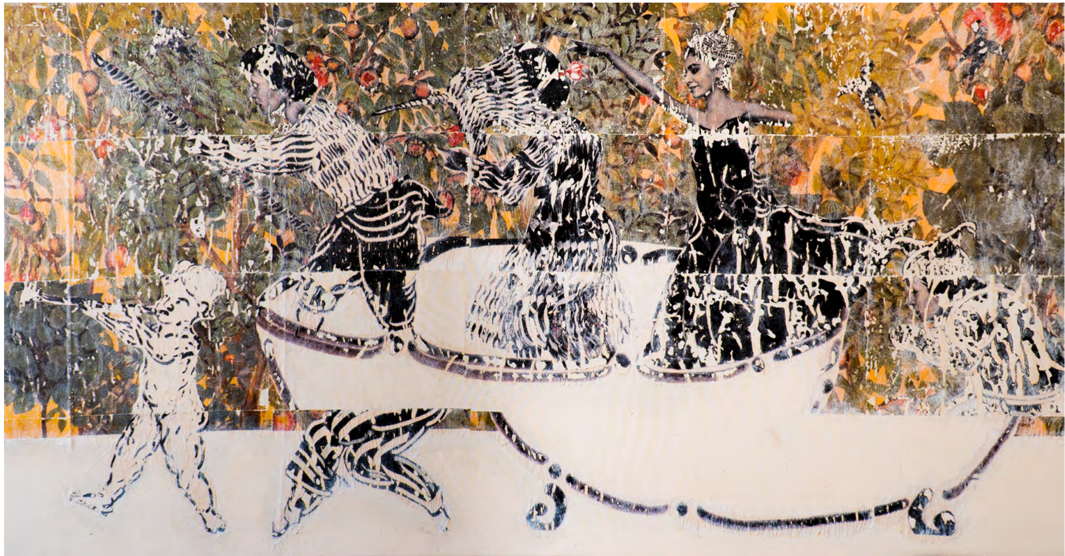
Last Steps (Dreamscape #6) , 2022 Reverse transfer printmaking on raw canvas 45 x 86 in