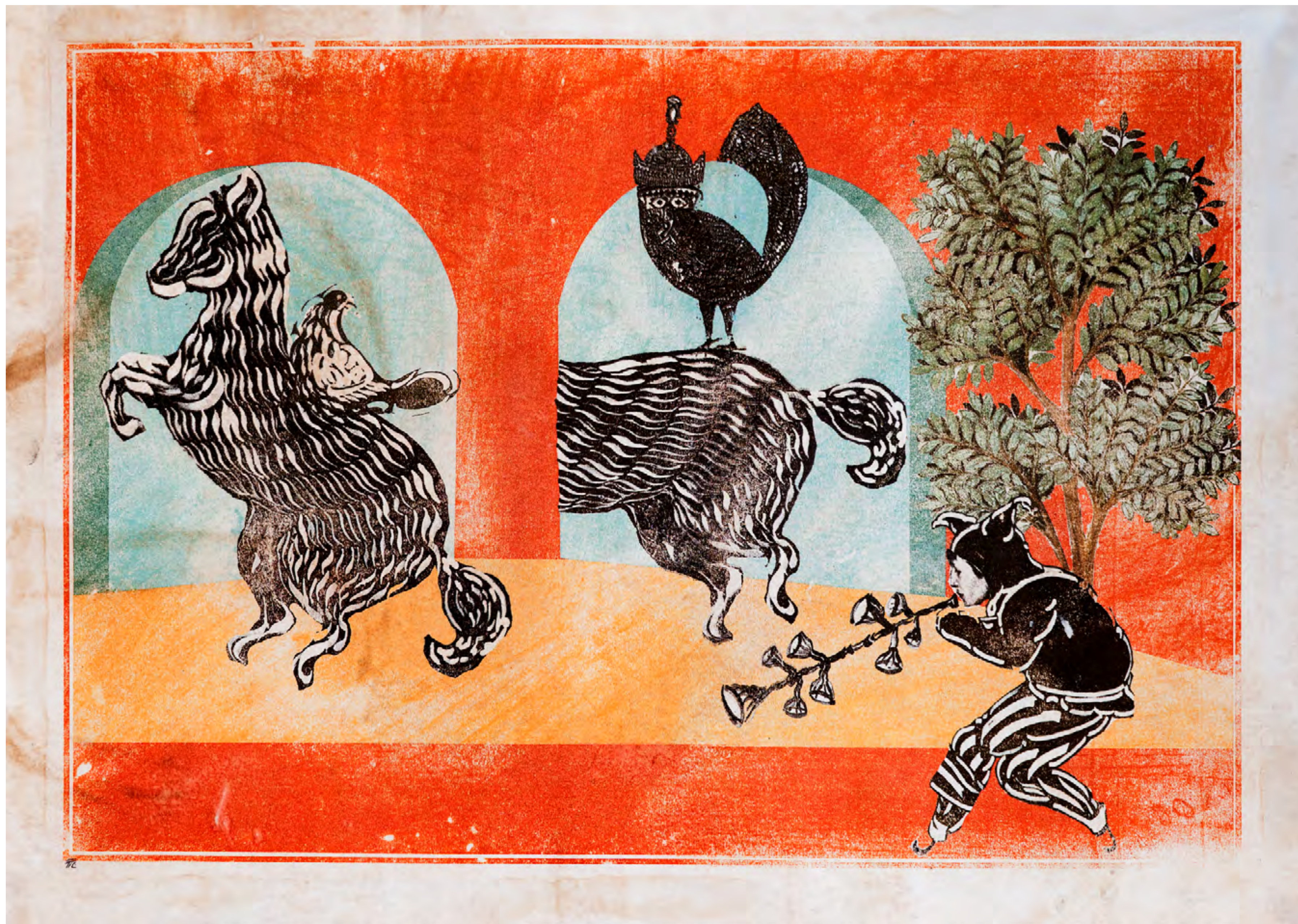
Fantasyland #7, 2022 Reverse transfer printmaking on handmade paper 12.75 x 18 in