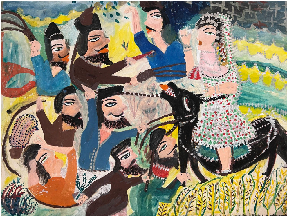
Untitled, 1990s. Mixed media on paper. 20 x 27.5 in.