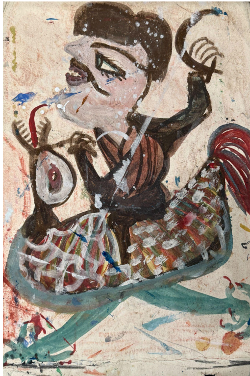
Untitled , 1990s. Mixed media on paper. 19 x 13.5 in.

Ghanbari’s practice stands as a radiant testament to the irrepressible nature of creativity. With no academic training or exposure to the global art world, she produced a visual language entirely her own—simultaneously vernacular and universal, intimate and archetypal. This exhibition honors Mokarrameh Ghanbari not only as a painter of rare vision, but as a cultural icon whose work continues to resonate far beyond the borders of her birthplace.