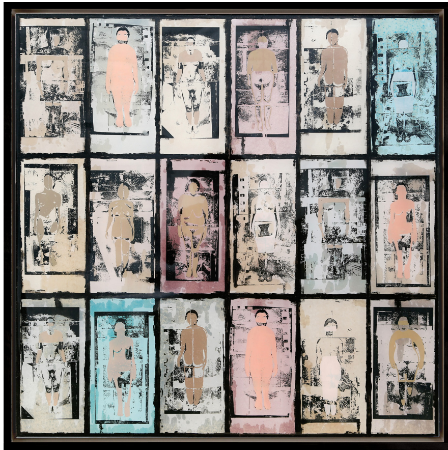
Identity Screening 5 , 2020, Unique silk screens on wood panels with acrylic wash and epoxy resin, 36 x 36 in