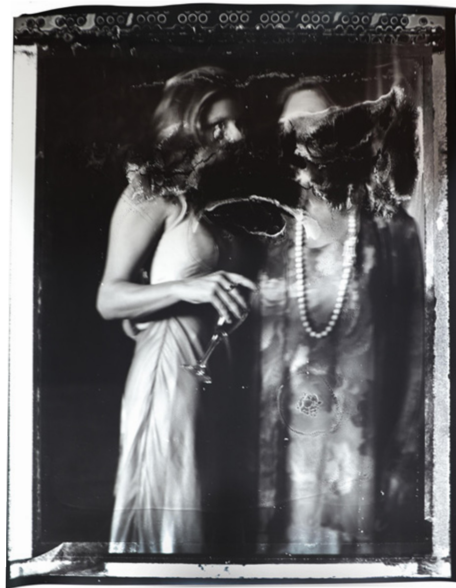
Wedding II , 2020, 1/2 + 1 AP, Polaroid 55 Gelatin Silver Print, 20 x 16 in