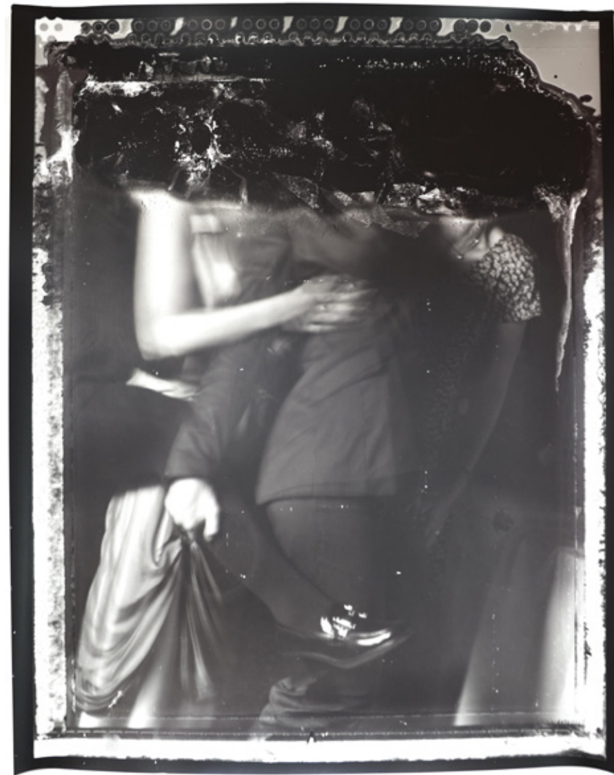
Wedding VI, 2020, 1/2 + 1 AP, Polaroid 55 Gelatin Silver Print, 20 x 16 in