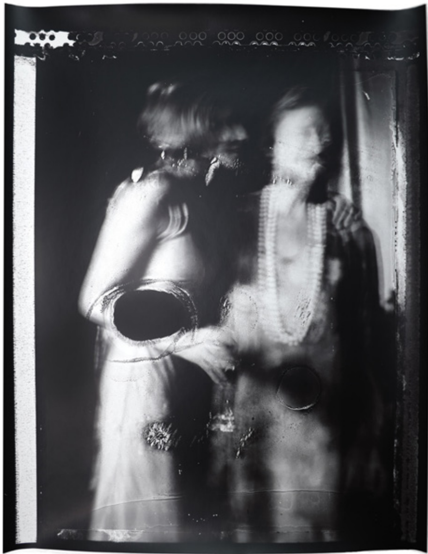
7 Wedding I , 2020, 1/2 + 1 AP, Polaroid 55 Gelatin Silver Print, 20 x 16 in