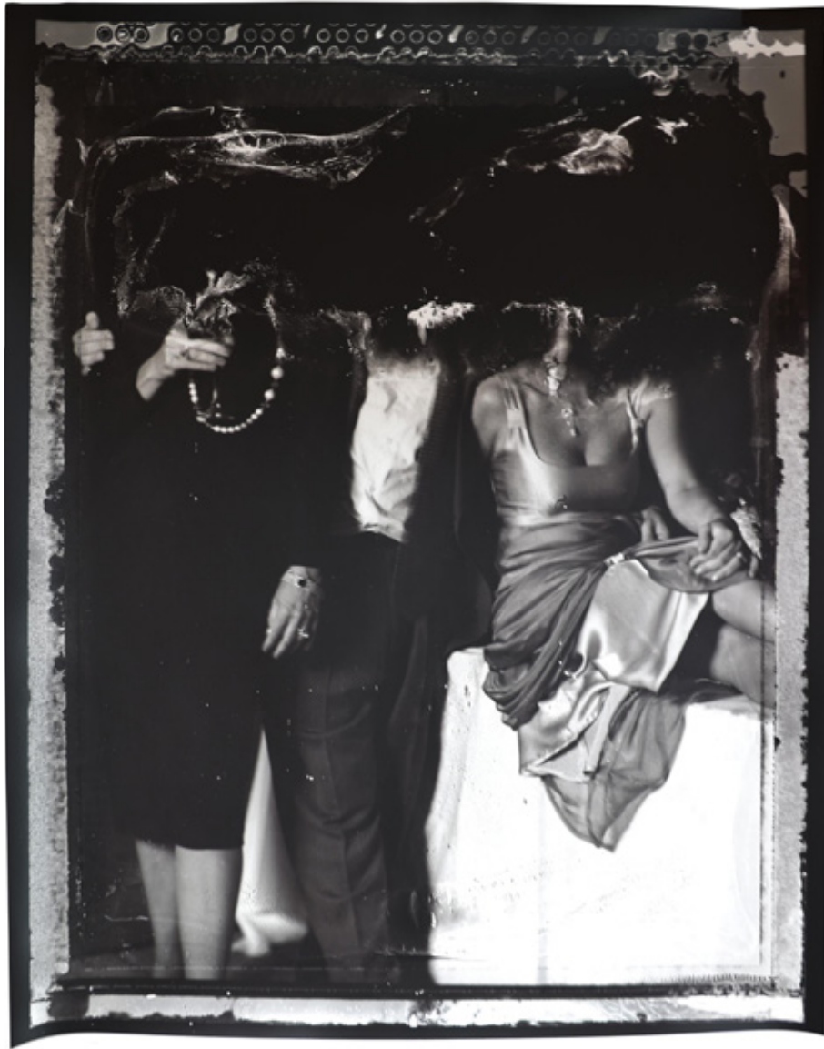
Wedding V, 2020, 1/2 + 1 AP, Polaroid 55 Gelatin Silver Print, 20 x 16 in