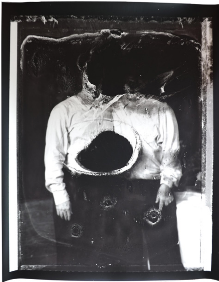
9 Wedding III, 2020, 1/2 + 1 AP, Polaroid 55 Gelatin Silver Print, 20 x 16 in