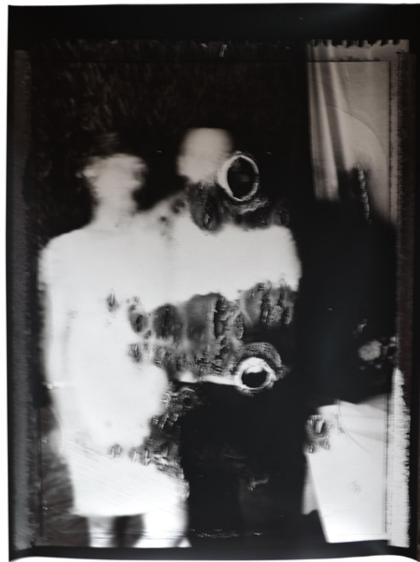
Wedding IV, 2020, 1/2 + 1 AP, Polaroid 55 Gelatin Silver Print, 20 x 16 in