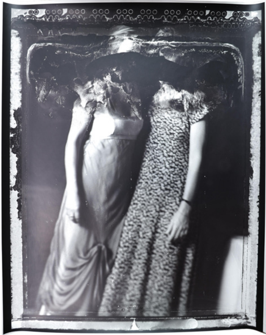
Wedding VII, 2020, 1/2 + 1 AP, Polaroid 55 Gelatin Silver Print, 20 x 16 in