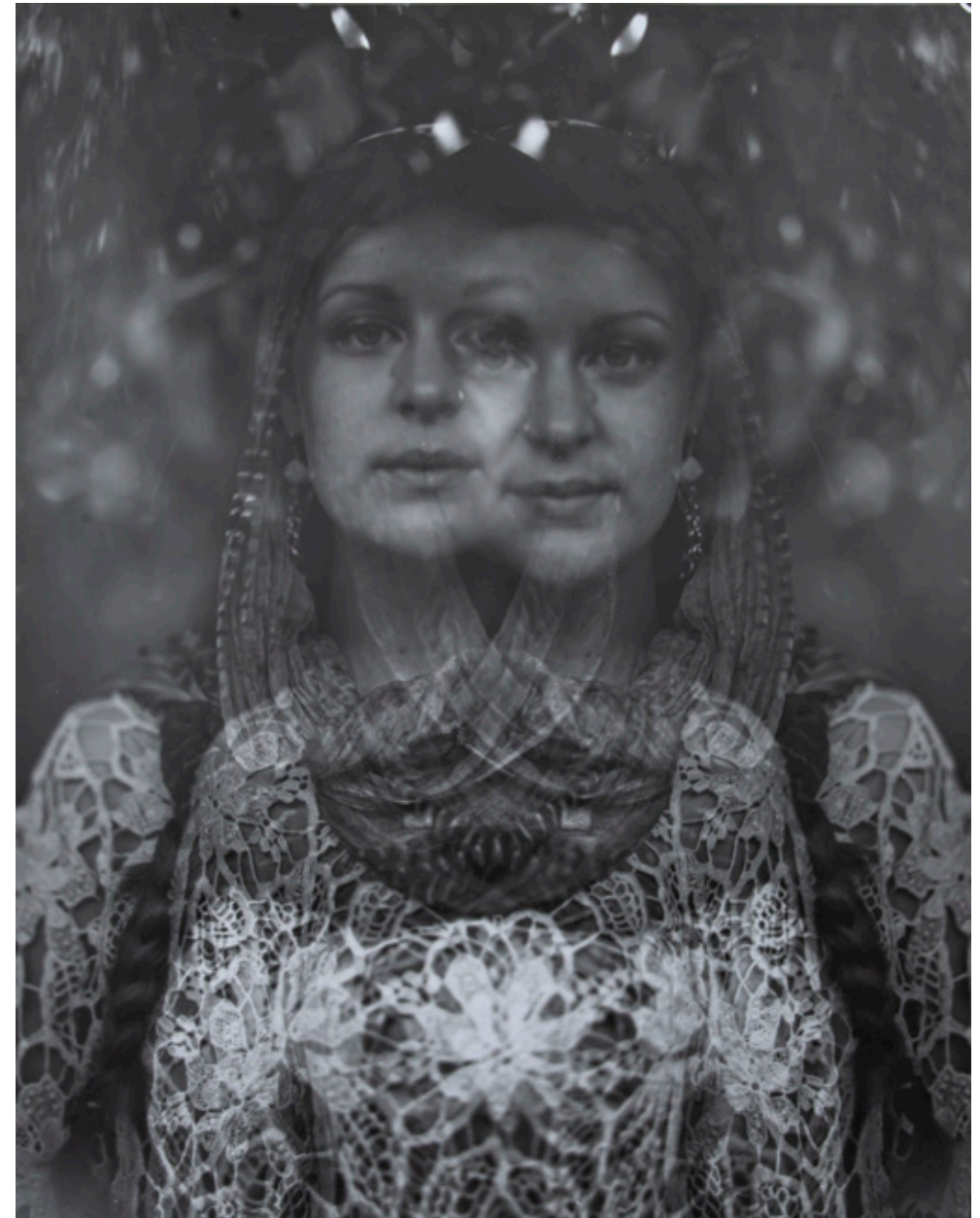
Shiva Loka , 2019, 2/3 + 2 AP, Layered Analog Negative Silver Print, 40 x 38 in

Hadi creates in layers, he is always experimenting with the developing process of each photograph. Using a myriad of antique cameras, Hadi's work begins with an analog portrait of his subjects, followed by the manipulation of those images. Hadi carefully pulls each photograph apart in their base negative form, and applies emulsion in a painterly fashion to create spontaneous and dynamic effects to the ink of the photograph. Through this layering of positives and negatives, text and imagery, Hadi creates imagery that is unique and soulful, and as modern as it is vintage.