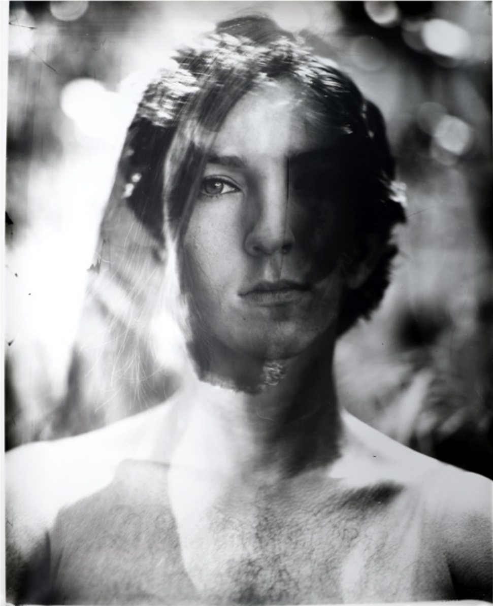
Fluidity II , (1/3 + I AP), 2021, Layered Negatives Gelatin Silver Print, 24 x 20 in