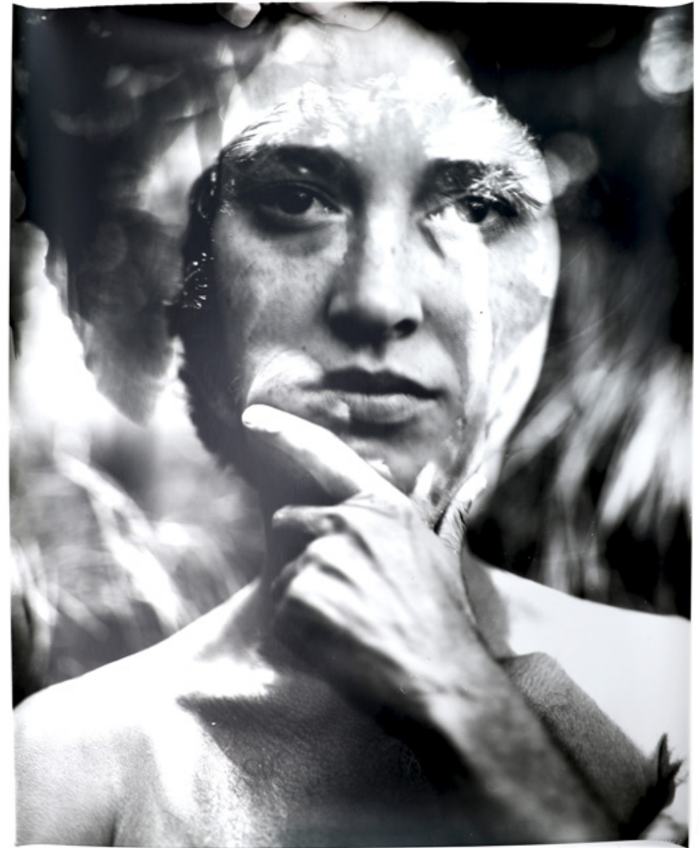
Fluidity III , (1/3 + I AP), 2021, Layered Negatives Gelatin Silver Print, 24 x 20 in