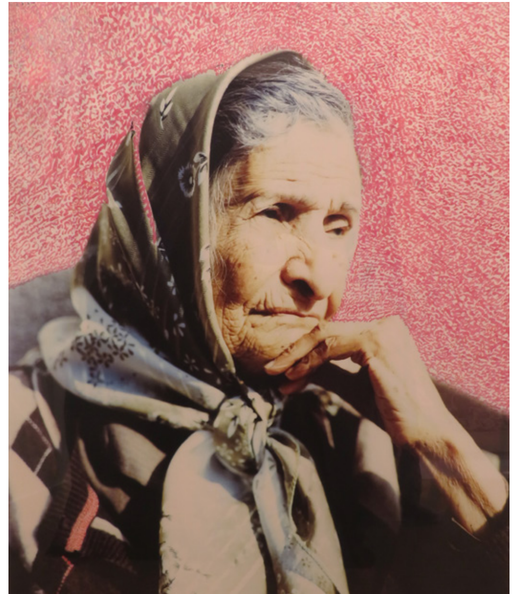
Mom, 2021, Unique, Type C Analog Print with Artist's Calligraphy, 37.5 x 29 in