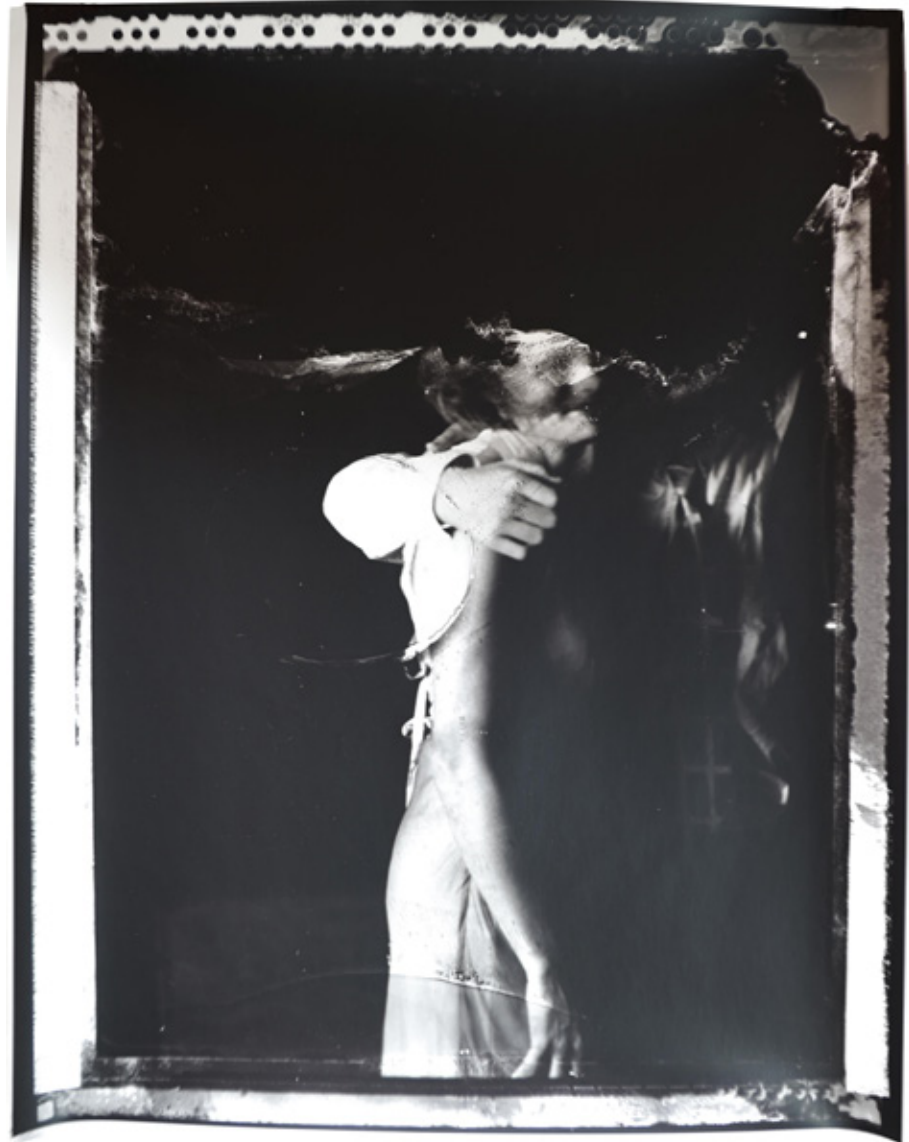
Wedding VIII, 2020, 1/2 + 1 AP, Polaroid 55 Gelatin Silver Print, 20 x 16 in